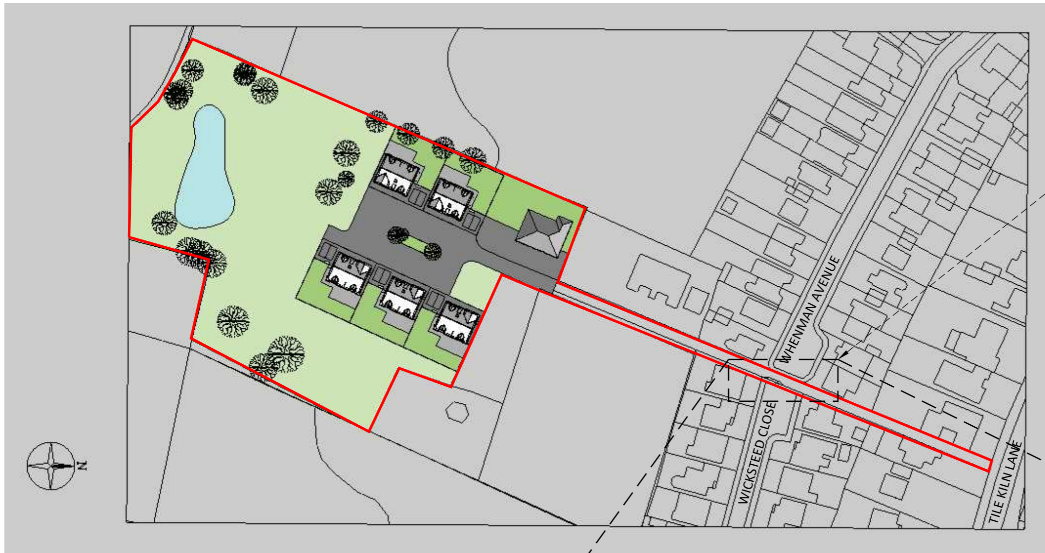
LOCATION PLAN (1:1250)