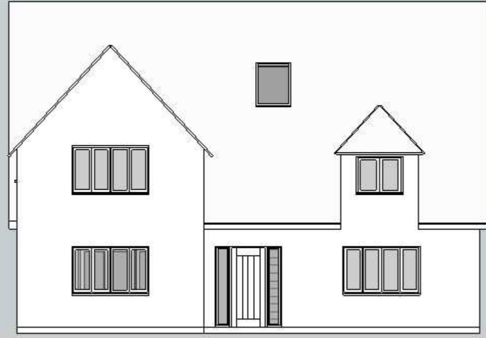
FRONT ELEVATION (TYPICAL)