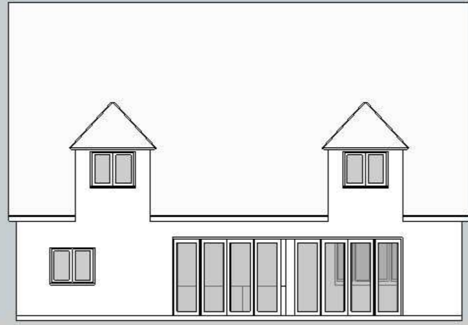
REAR ELEVATION (TYPICAL)