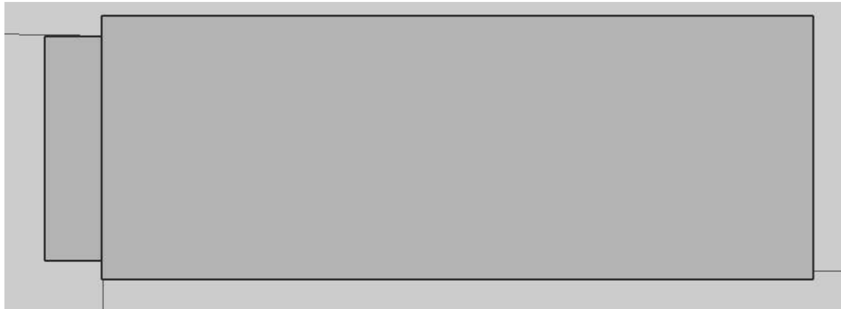
BUILDING TO BE REMOVED 01 OUTLINE OF FLOORPLAN

GROUND FLOOR OUTLINE, FRONT & SIDE OUTLINE ELEVATIONS OF BUILDING 01 WHICH IS TO BE REMOVED