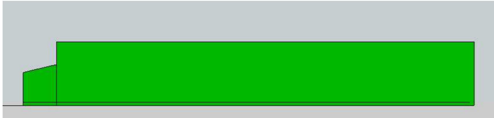
BUILDING TO BE REMOVED 01 FRONT ELEVATION