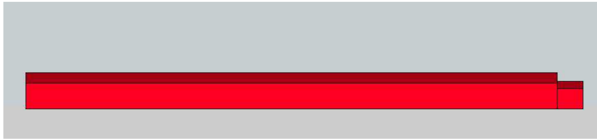
BUILDING TO BE REMOVED 03 FRONT ELEVATION (1:200)