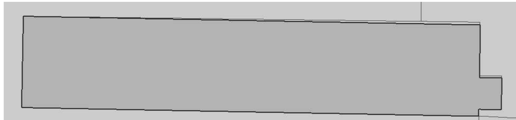
BUILDING TO BE REMOVED 03 OUTLINE OF FLOORPLAN