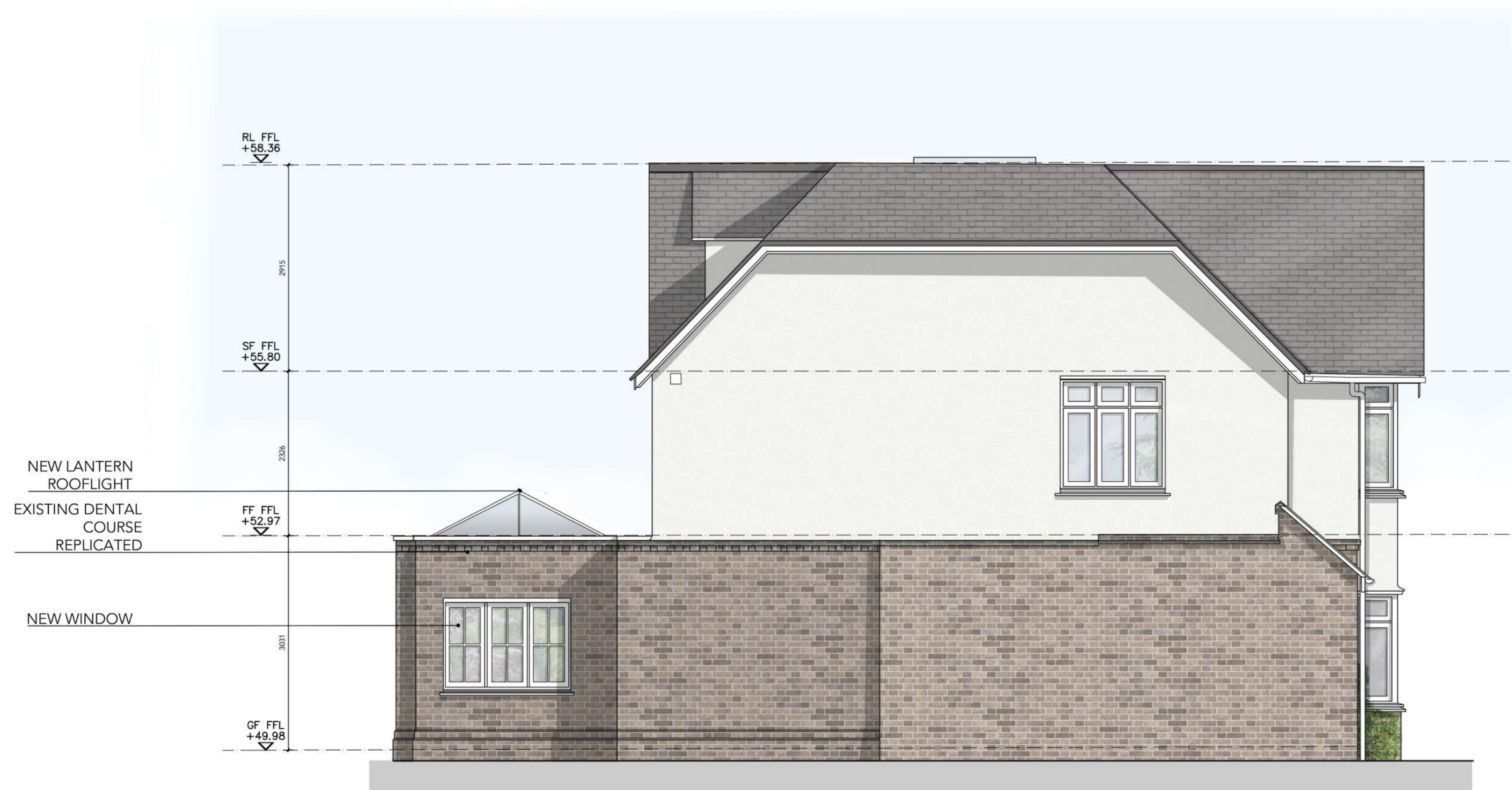
PROPOSED ELEVATION Scale 1:50