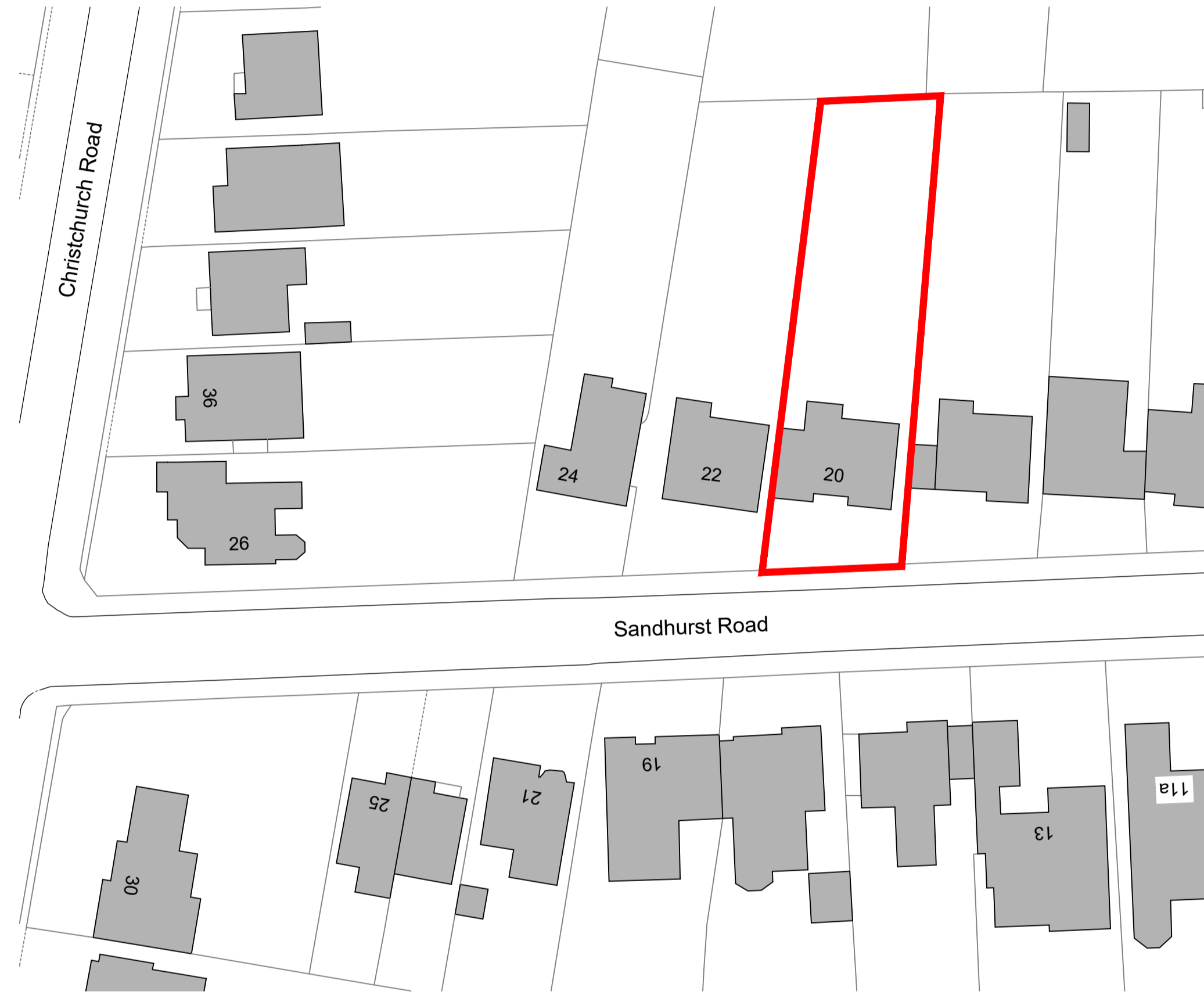
PLAN: SITE PLAN Scale 1:500