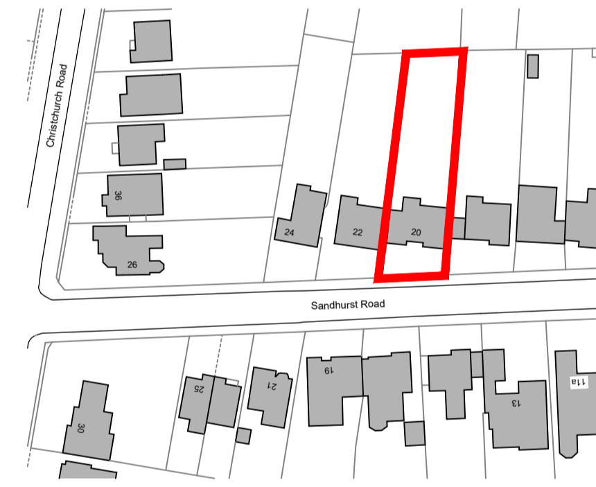
PLAN: LOCATION PLAN Scale 1:1250