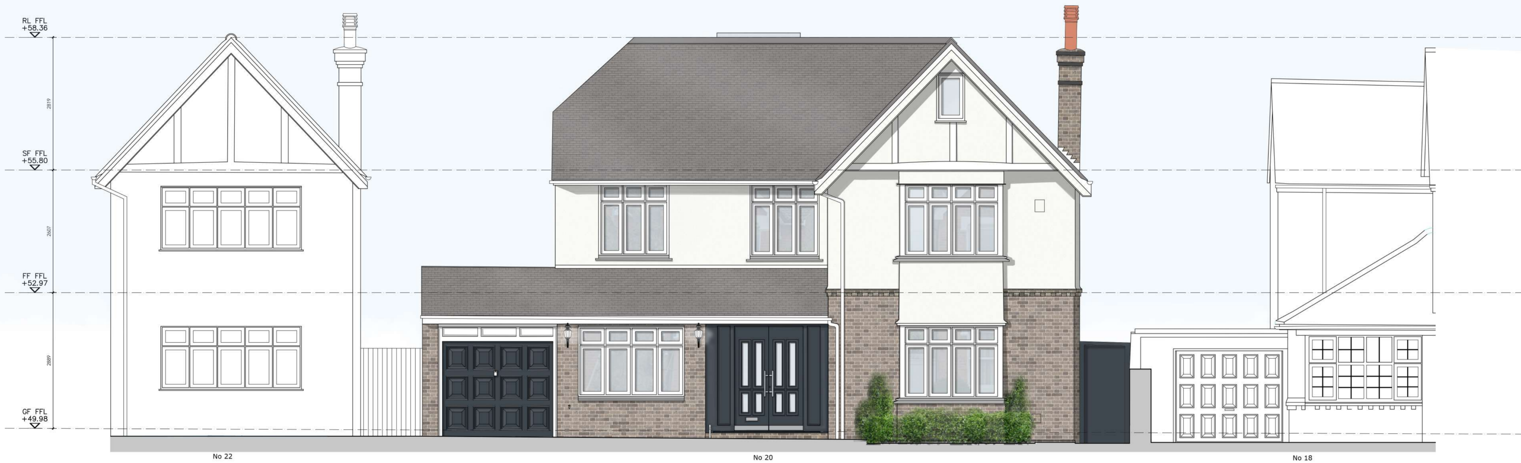
PROPOSED ELEVATION Scale 1:50