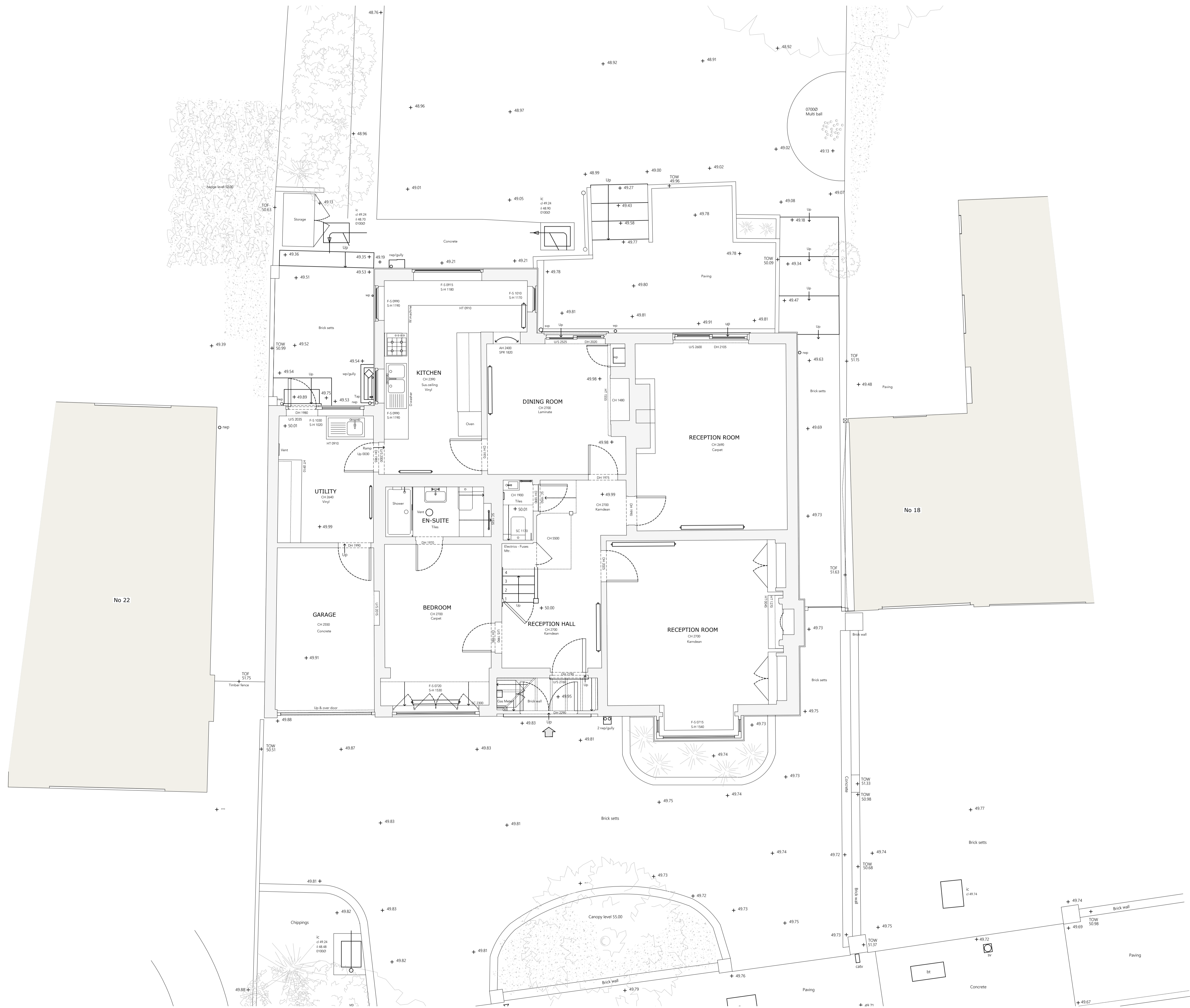
EXISTING GROUND FLOOR PLAN Scale 1:50