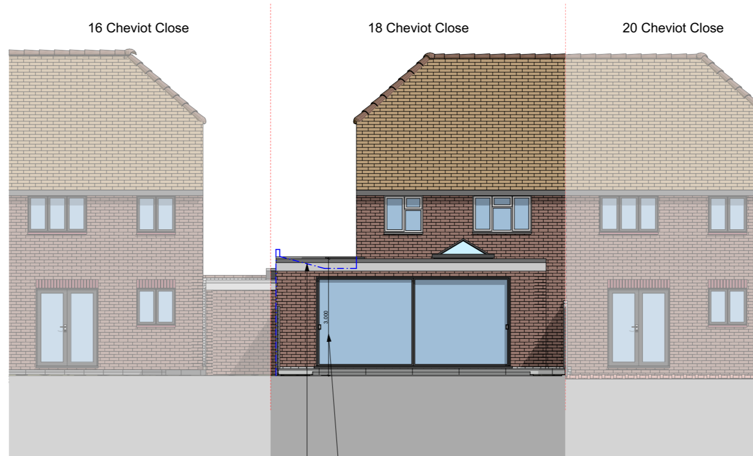
Proposed Rear Elevation Scale: 1:100

Blue line indicates the existing rear extension Rear extension eaves not to exceed 3.0 m from natural ground floor