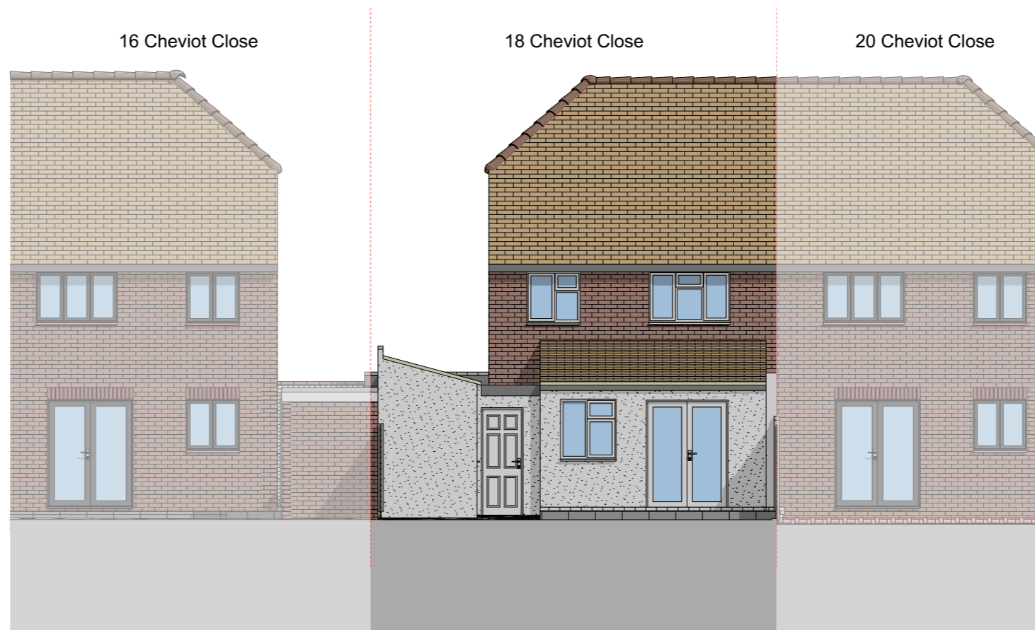
Existing Rear Elevation Scale: 1:100