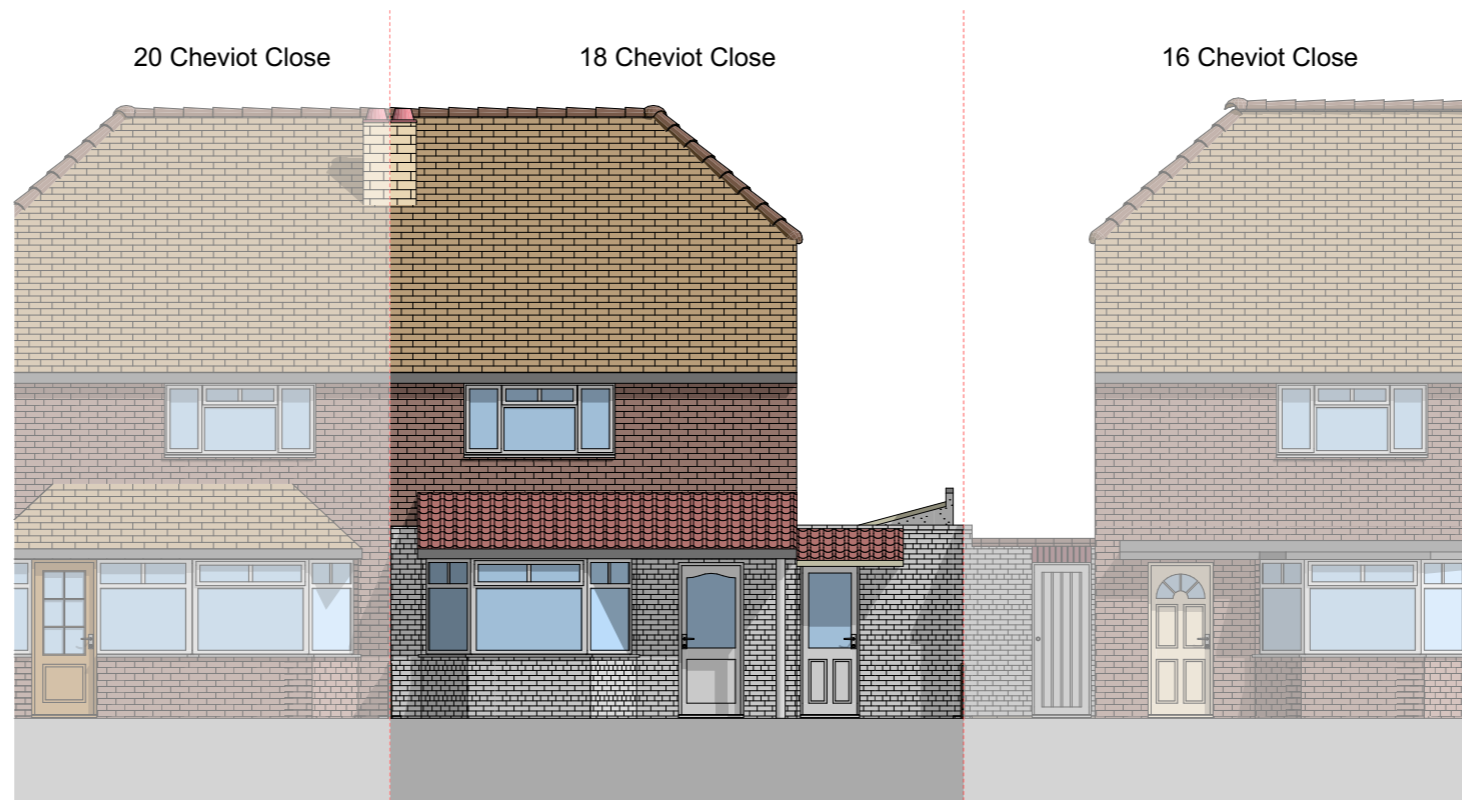
Existing Front Elevation Scale: 1:100