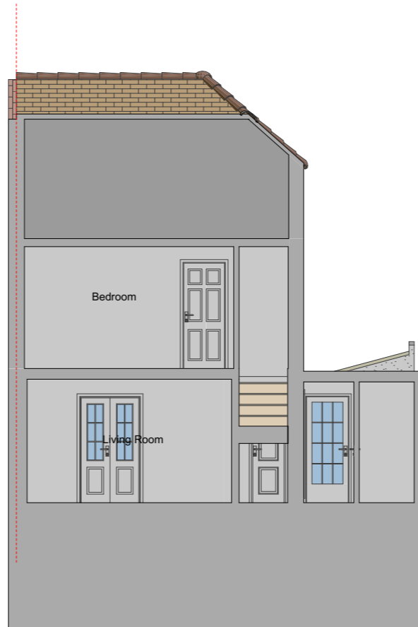
B Existing Building Section Scale: 1:100