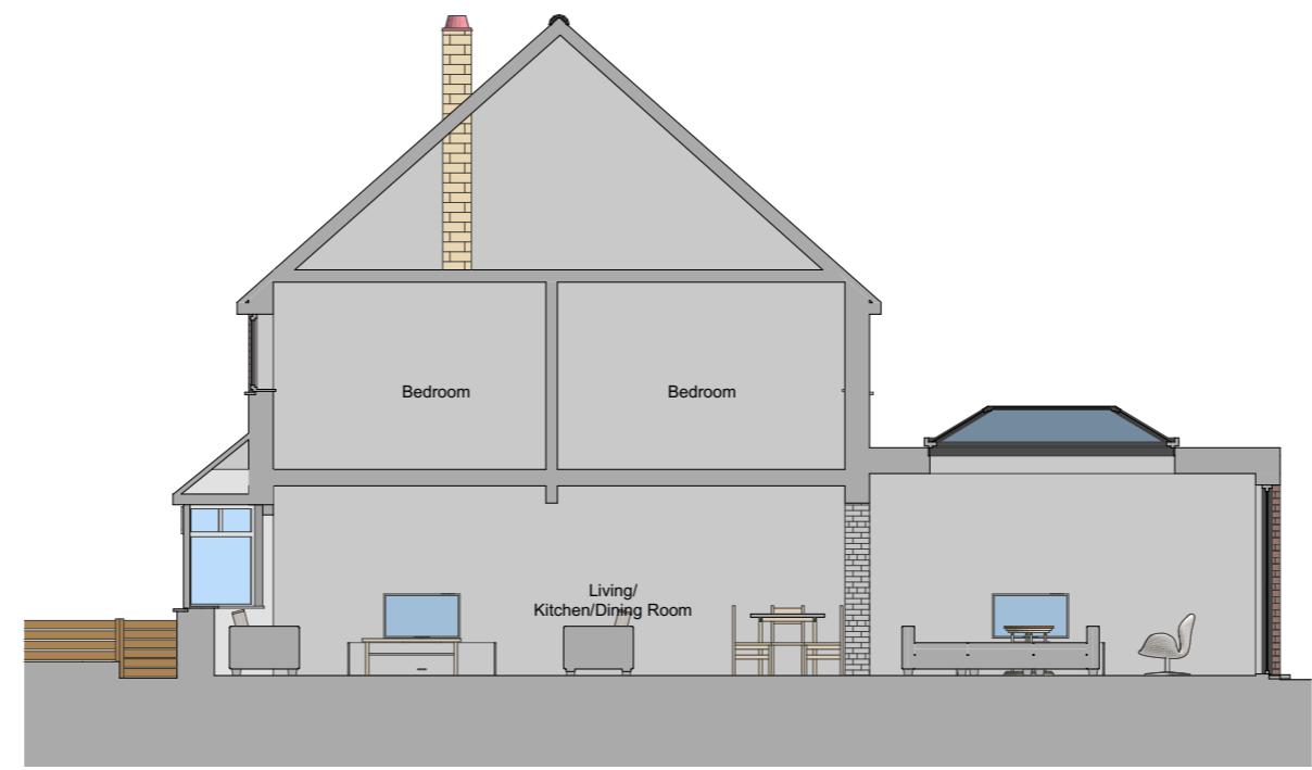
A Proposed Building Section Scale: 1:100