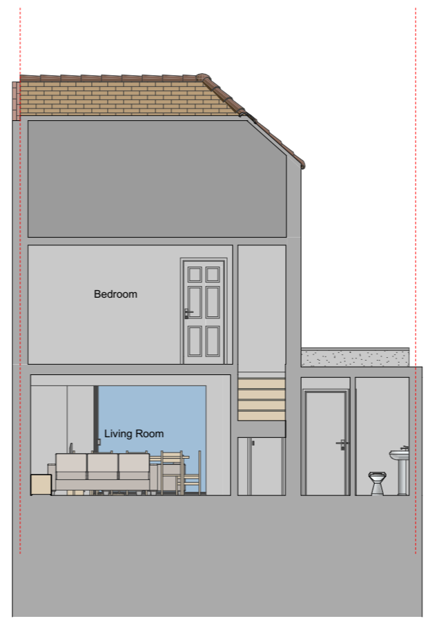
B Proposed Building Section Scale: 1:100