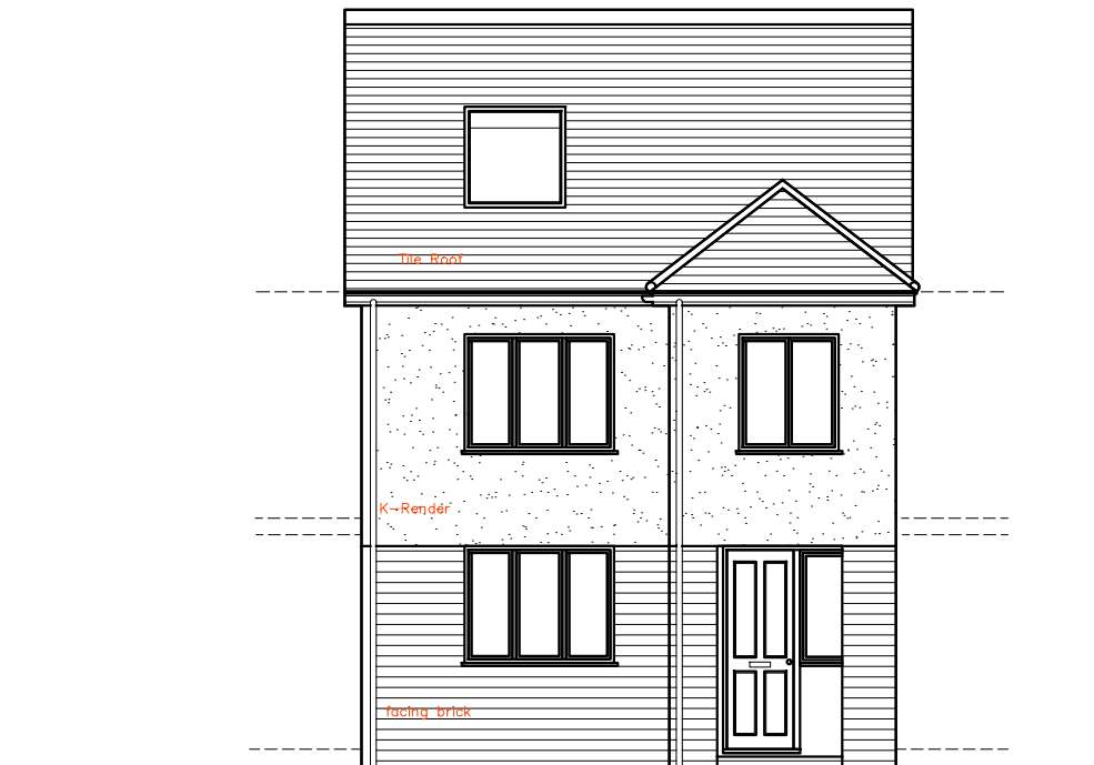
HOUSE TYPE "A" PROPOSED FRONT ELEVATION