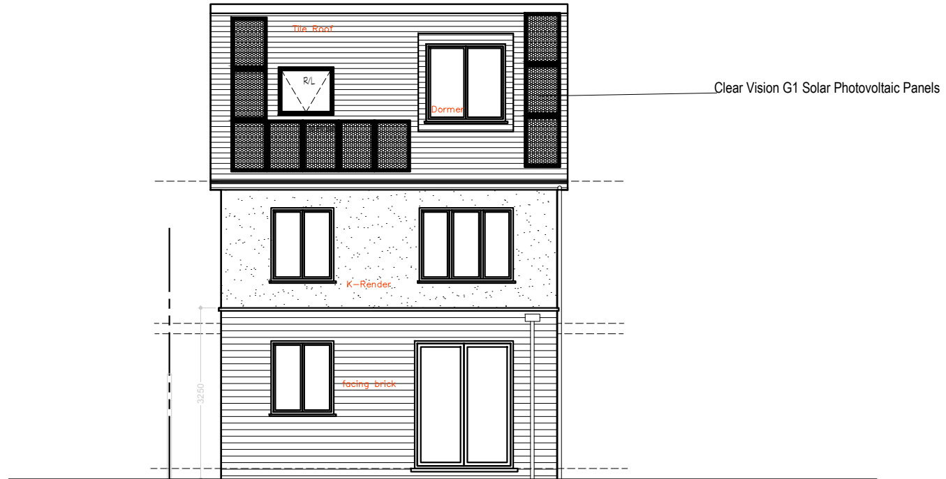
HOUSE TYPE "A" PROPOSED REAR ELEVATION