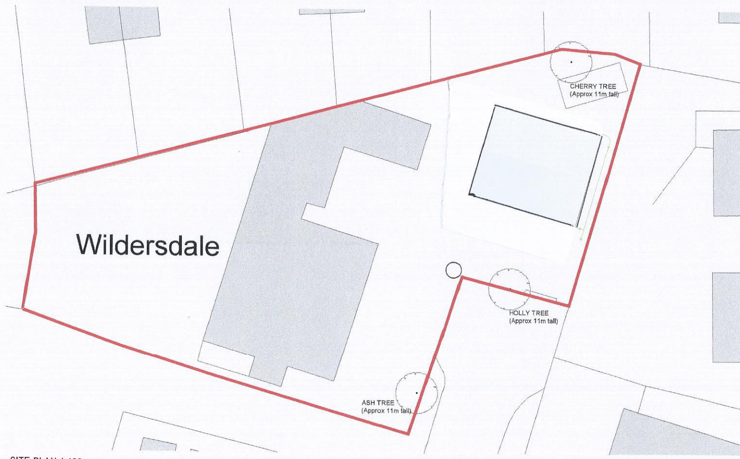
SITE PLAN 1:100