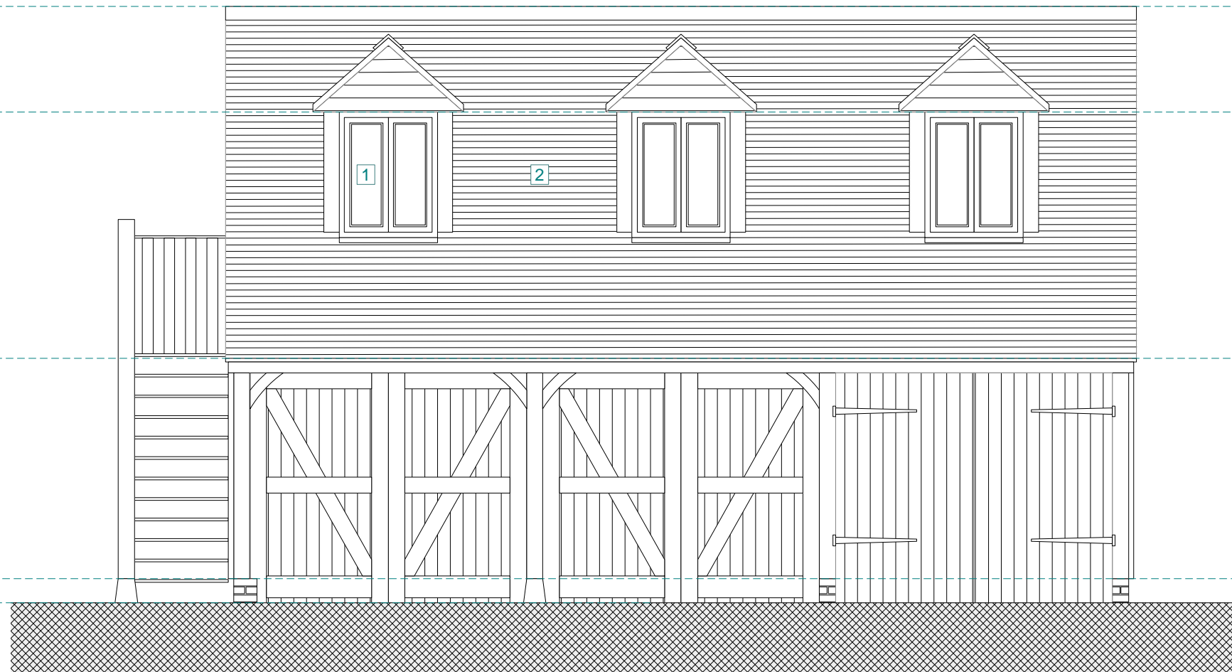
002 Existing East Elevation 1:50

This drawing is copyright and shall not be produced nor used for any other purpose without the written permission of Kaner Olette Architects. If in doubt ASK. Drawing measurements shall be obtained by scaling. Verify all dimensions prior to construction. The contractor is responsible for checking all dimensions on site. Report any discrepancies, errors or omissions to the architect immediately. The contractor shall ensure that all goods, materials, and workmanship conform with current british agreement certificates, british standards, building regulations, and ensure that all works are executed in full compliance with all current codes of practice and regulations in respect of health and safety.