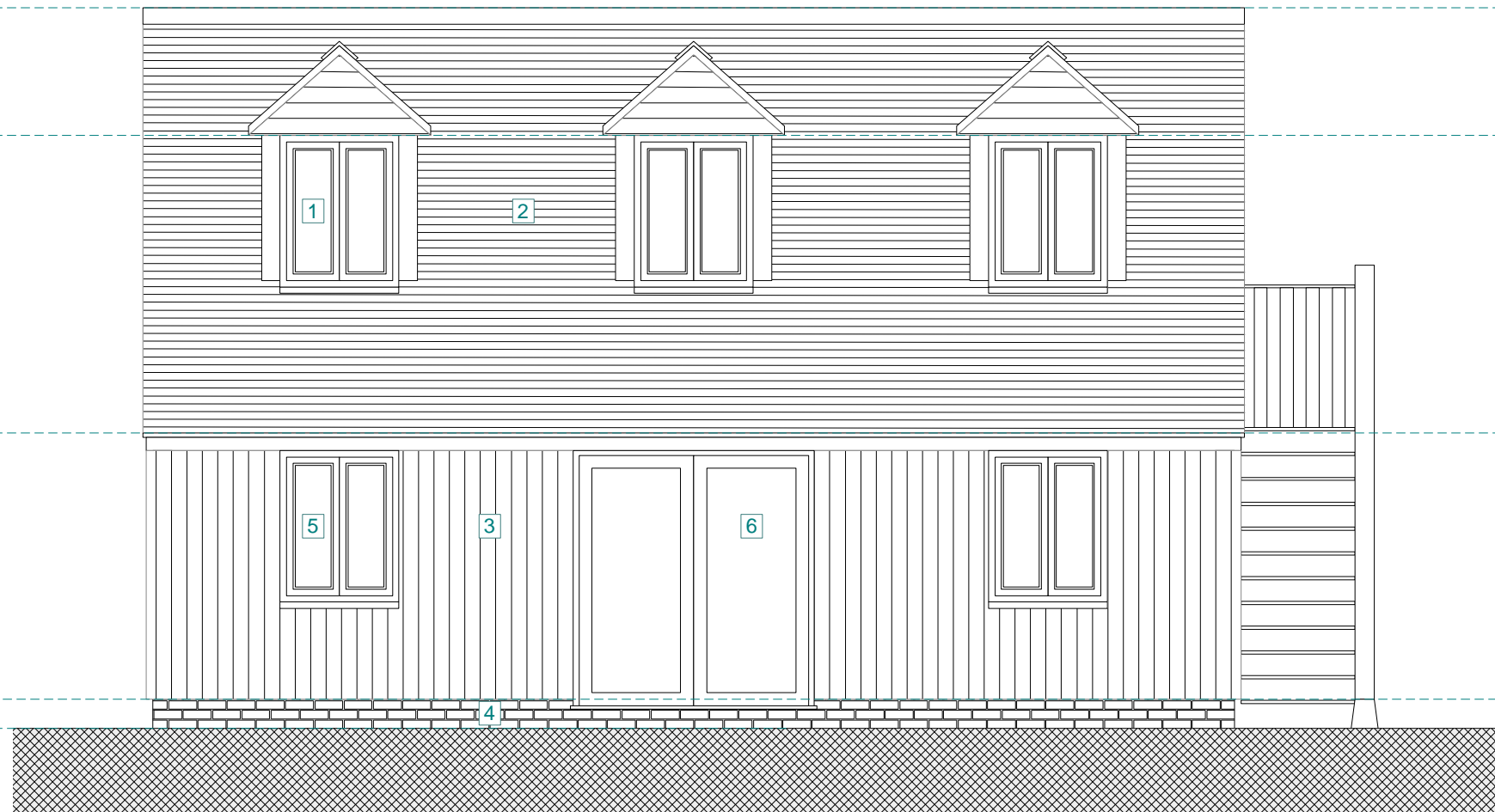
002 | Proposed West Elevation 1:50

This drawing is copyright and shall not be produced nor used for any other purpose without the written permission of Kaner Olette Architects. If in doubt ASK. Drawing measurements shall be obtained by scaling. Verify all dimensions prior to construction. The contractor is responsible for checking all dimensions on site. Report any discrepancies, errors or omissions to the architect immediately. The contractor shall ensure that all goods, materials, and workmanship conform with current british agreement certificates, british standards, building regulations, and ensure that all works are executed in full compliance with all current codes of practice and regulations in respect of health and safety.