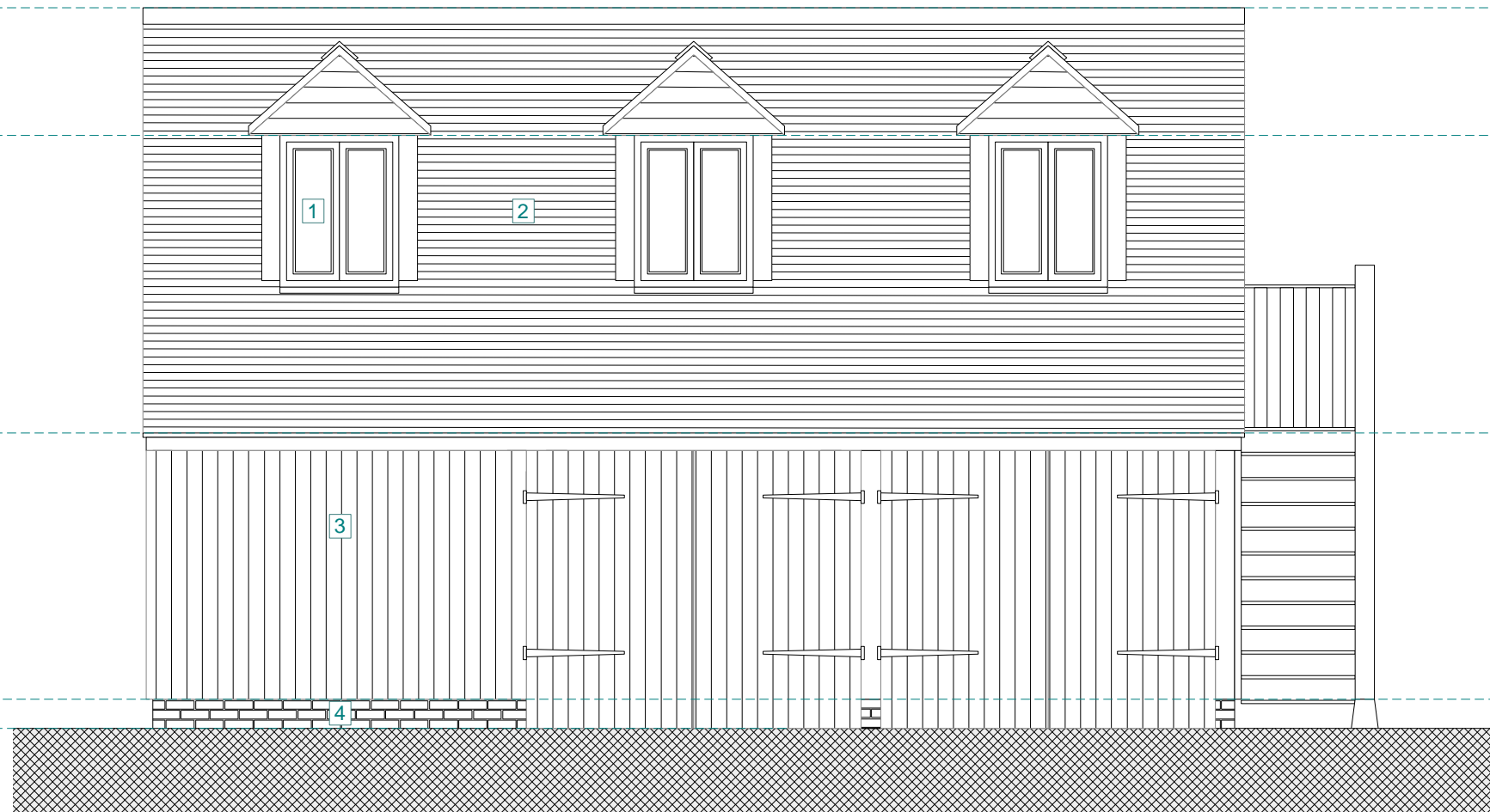
002 Existing West Elevation 1:50

This drawing is copyright and shall not be produced nor used for any other purpose without the written permission of Kaner Olette Architects. If in doubt ASK. Drawing measurements shall be obtained by scaling. Verify all dimensions prior to construction. The contractor is responsible for checking all dimensions on site. Report any discrepancies, errors or omissions to the architect immediately. The contractor shall ensure that all goods, materials, and workmanship conform with current british agreement certificates, british standards, building regulations, and ensure that all works are executed in full compliance with all current codes of practice and regulations in respect of health and safety.