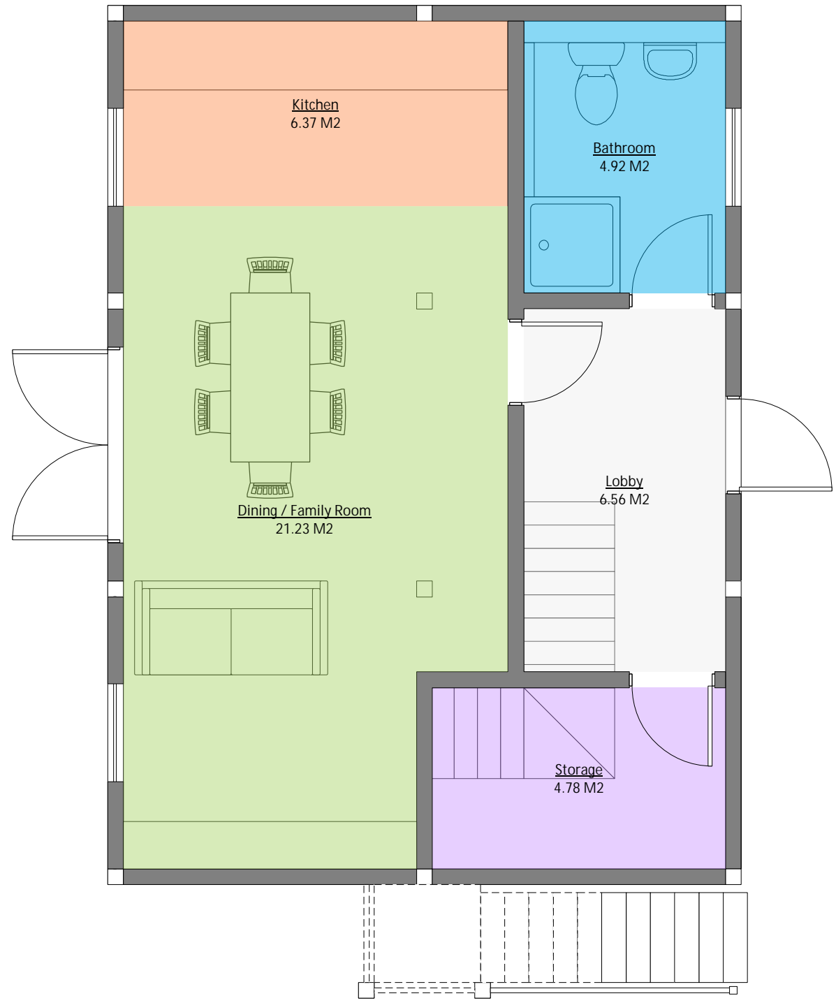
002 Proposed Ground Floor Plan 1:50