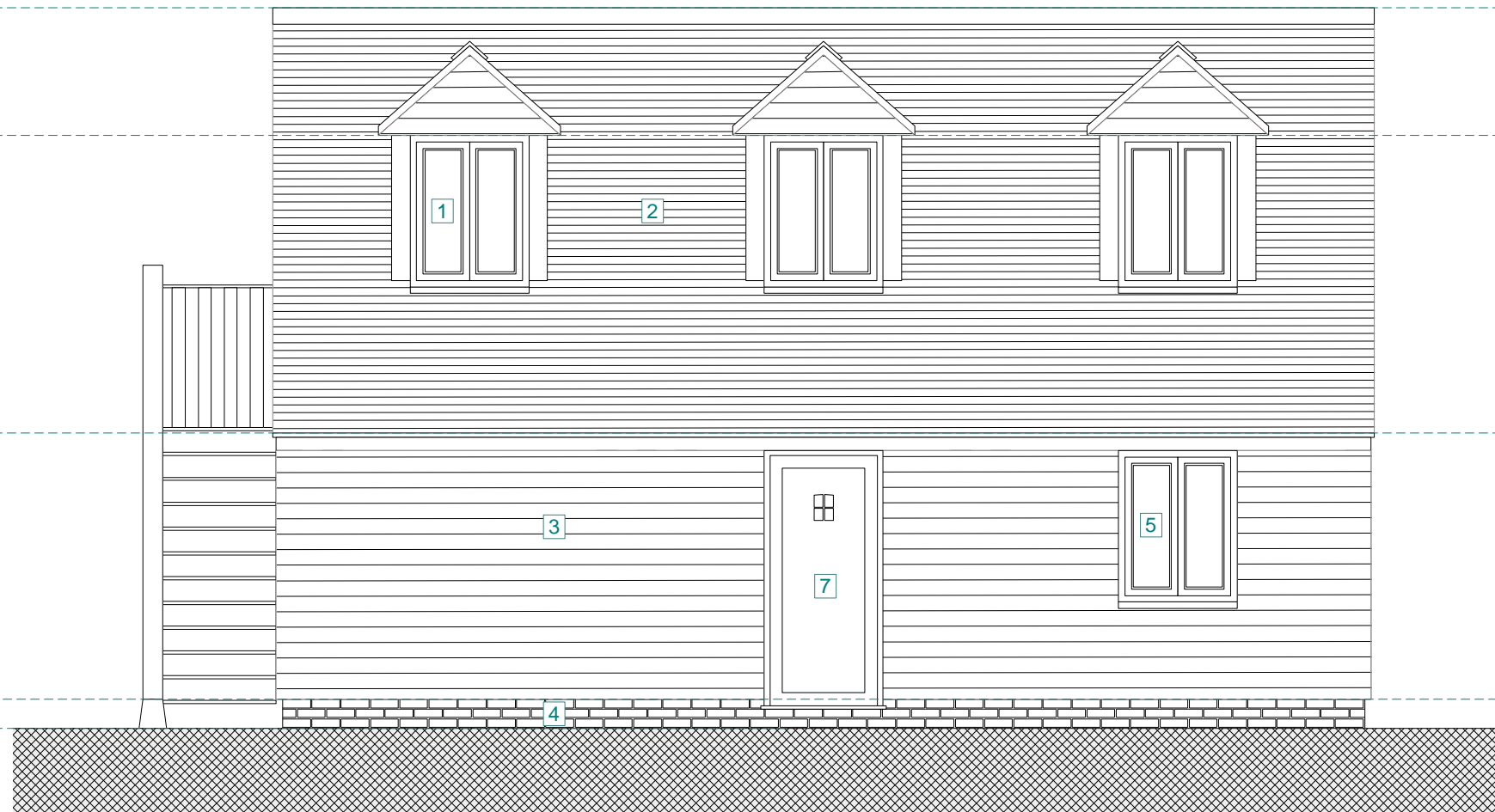
002 | Proposed East Elevation 1:50

This drawing is copyright and shall not be produced nor used for any other purpose without the written permission of Kaner Olette Architects. If in doubt ASK. Drawing measurements shall be obtained by scaling. Verify all dimensions prior to construction. The contractor is responsible for checking all dimensions on site. Report any discrepancies, errors or omissions to the architect immediately. The contractor shall ensure that all goods, materials, and workmanship conform with current british agreement certificates, british standards, building regulations, and ensure that all works are executed in full compliance with all current codes of practice and regulations in respect of health and safety.