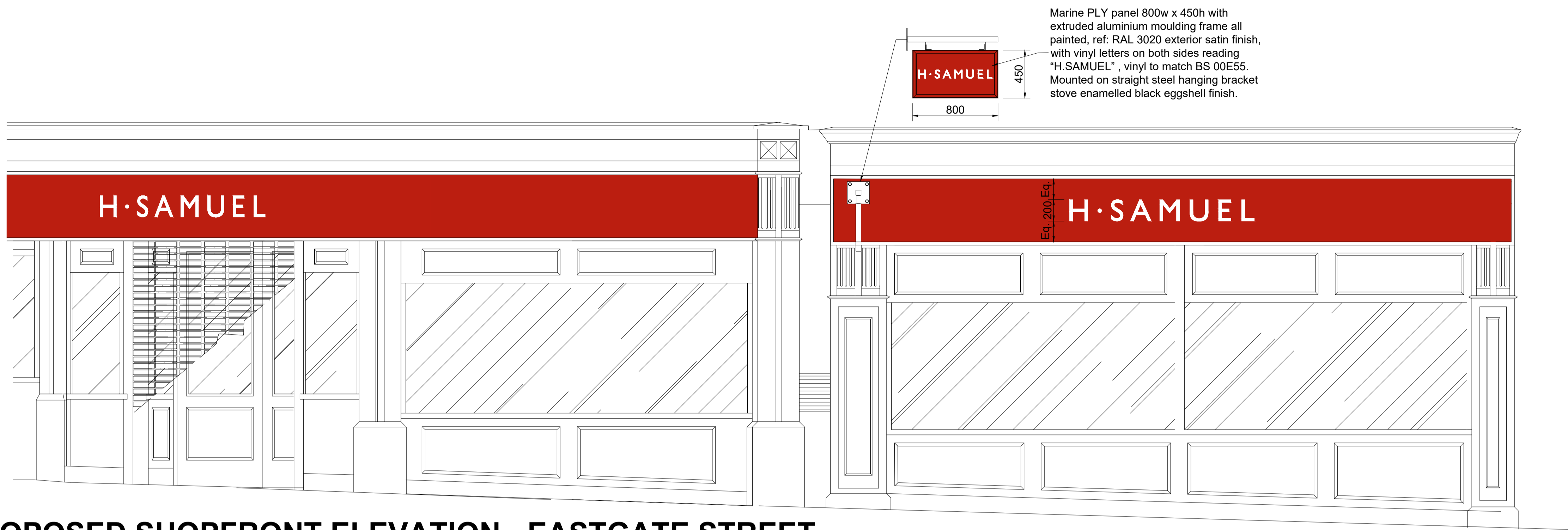
PROPOSED SHOPFRONT ELEVATION - EASTGATE STREET