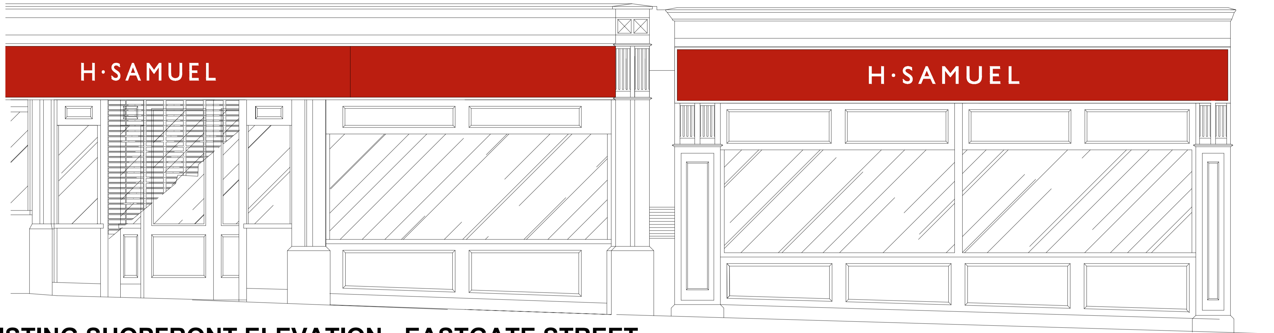
EXISTING SHOPFRONT ELEVATION - EASTGATE STREET