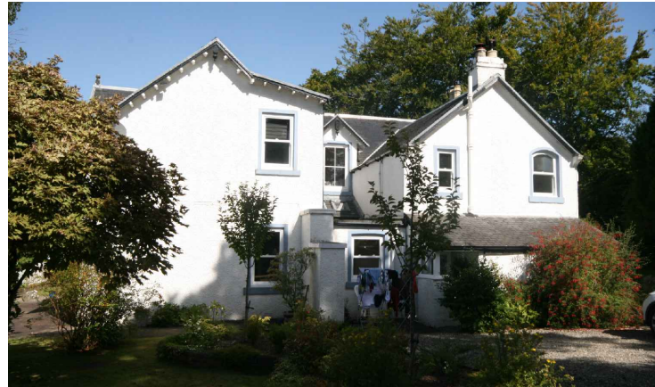
SOUTH ELEVATION AS EXISTING