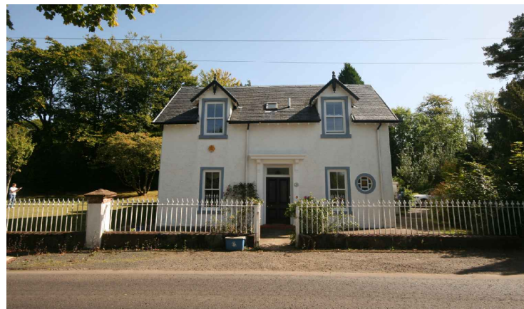
WEST ELEVATION AS EXISTING