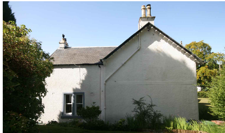
EAST ELEVATION AS EXISTING