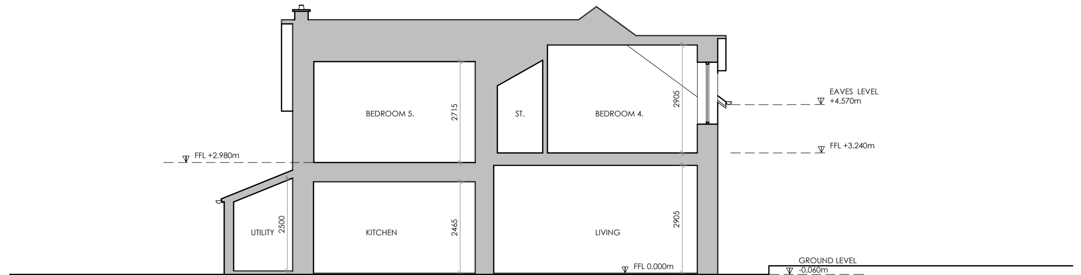
SECTION A-A AS EXISTING