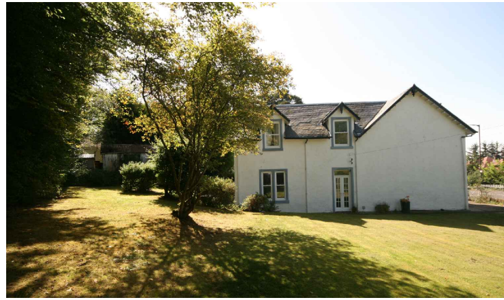
NORTH ELEVATION AS EXISTING