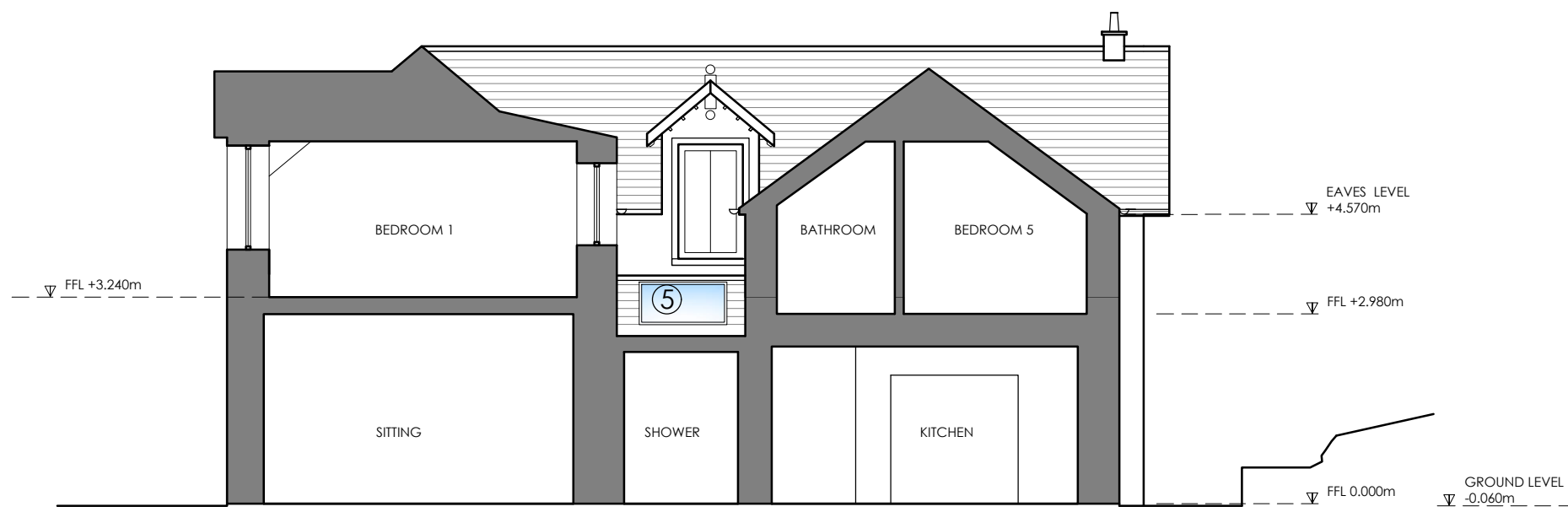
SECTION B-B AS PROPOSED