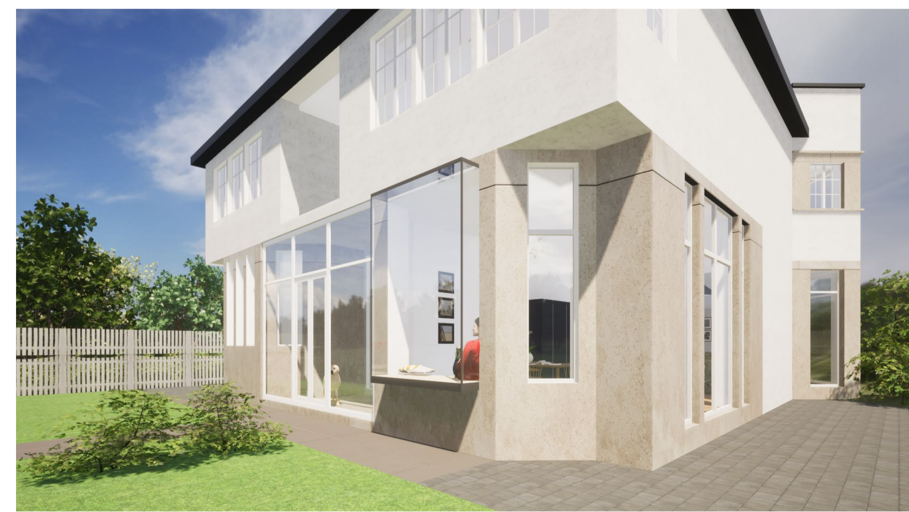
Visual of proposed rear elevation with oriel window - NTS