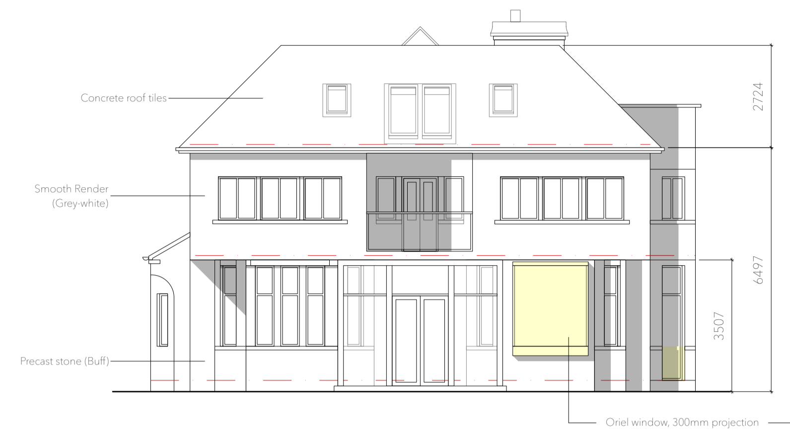
Proposed Southwest Elevation - @ 1:100