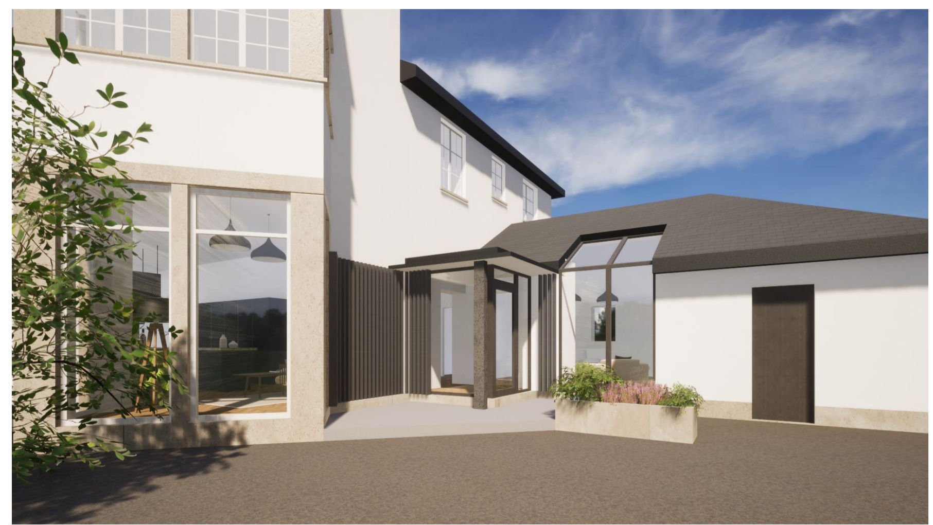
Visual of proposed front porch and eaves light - NTS