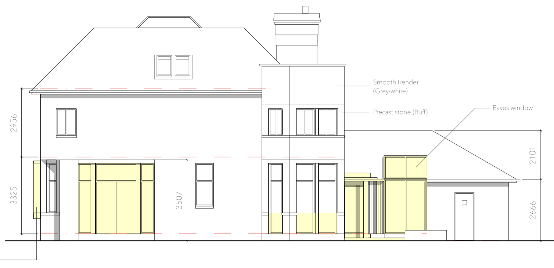
Proposed Southeast Elevation - @ 1:100