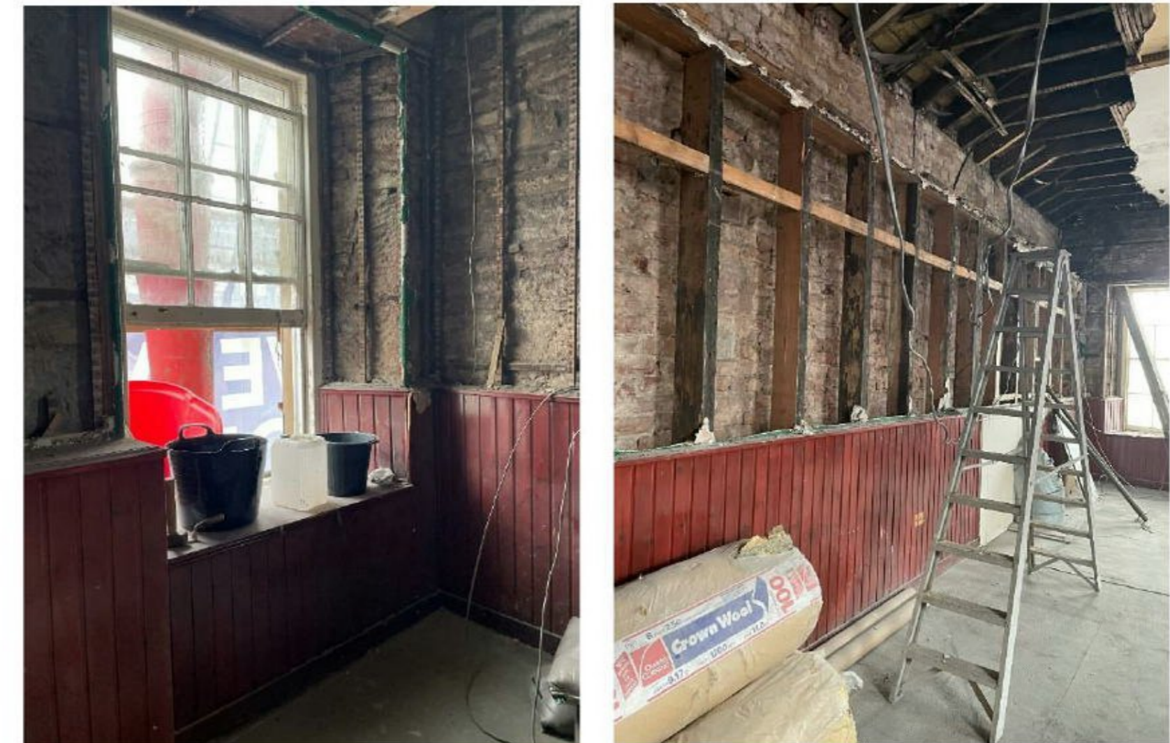
Photographs of the first floor void which is to be the staff facilities