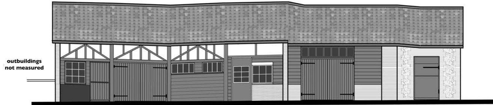
:: East Elevation :: Existing :: 1:100 at A3 ::