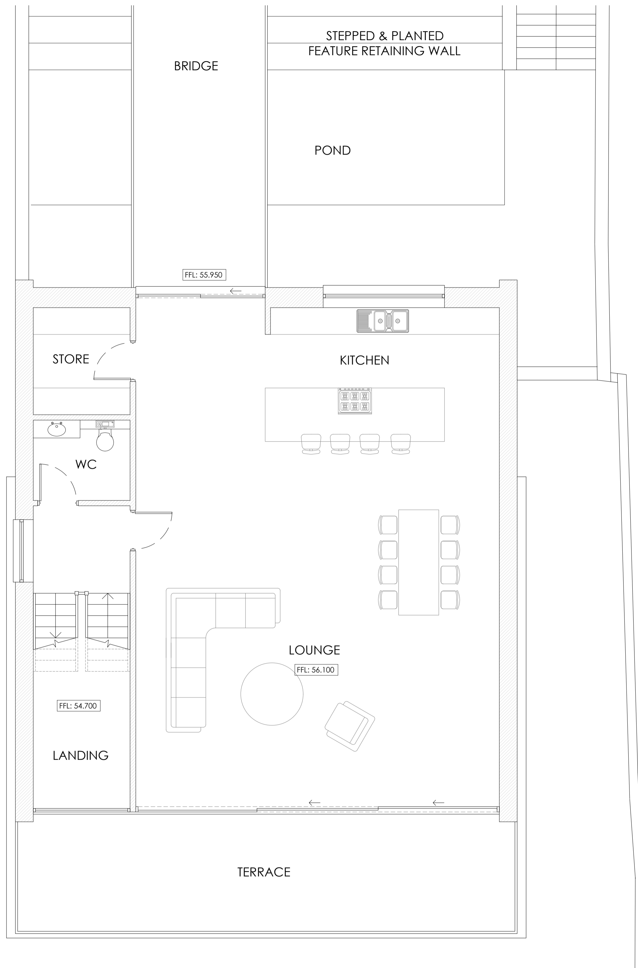
FIRST FLOOR PLAN 1:50