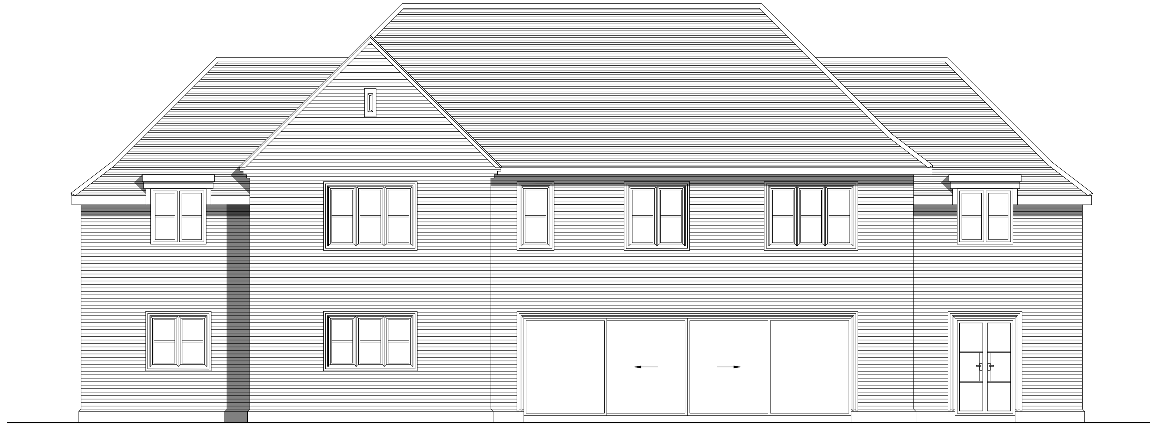
REAR ELEVATION (EAST)