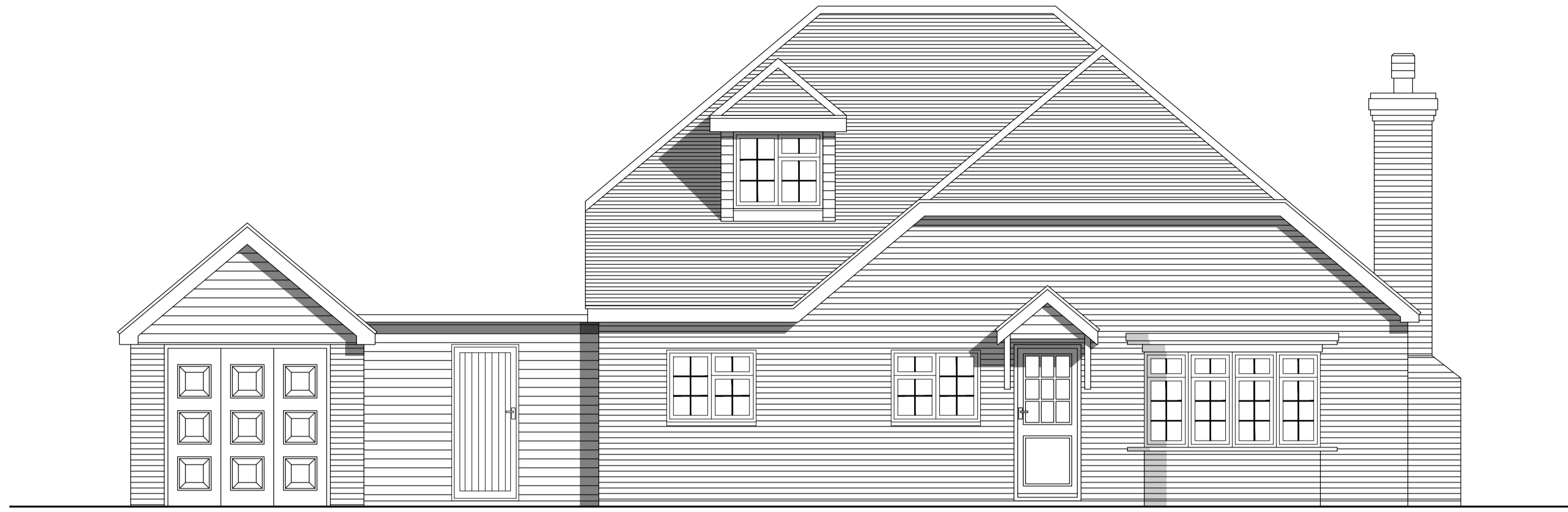
FRONT ELEVATION (WEST)