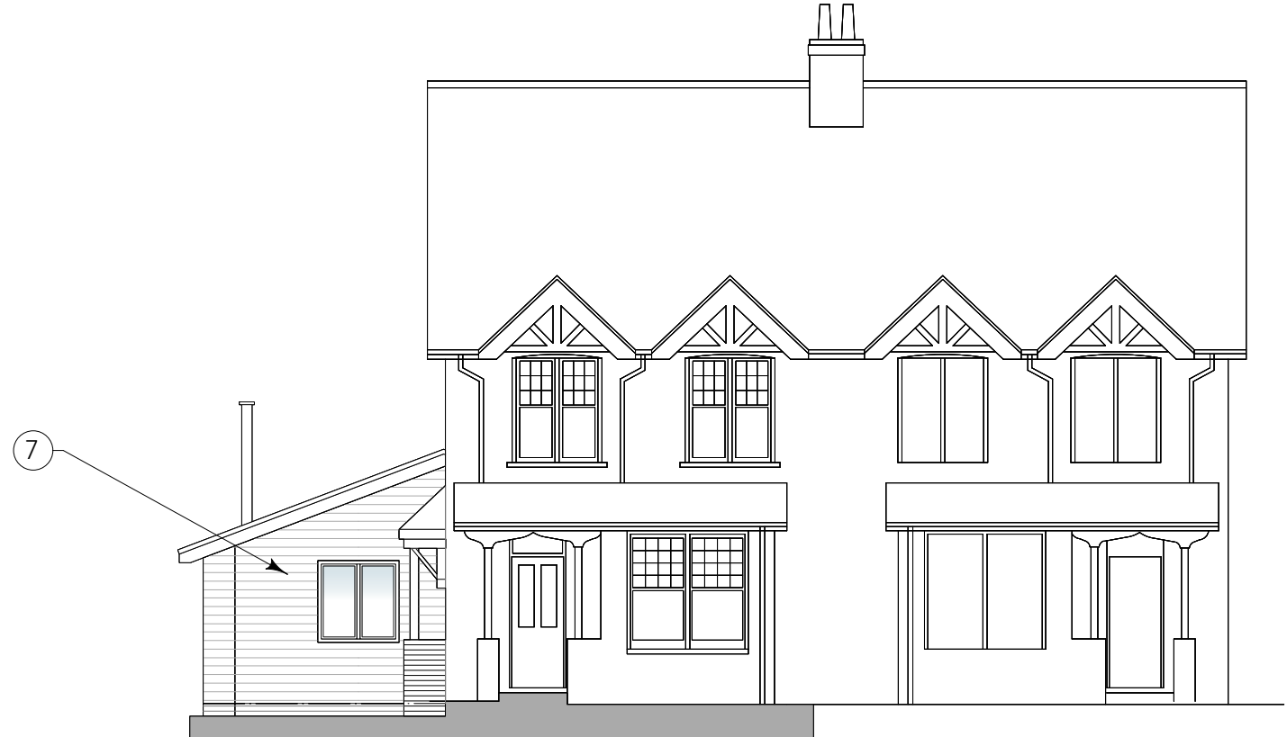
78.0m DATUM EAST ELEVATION