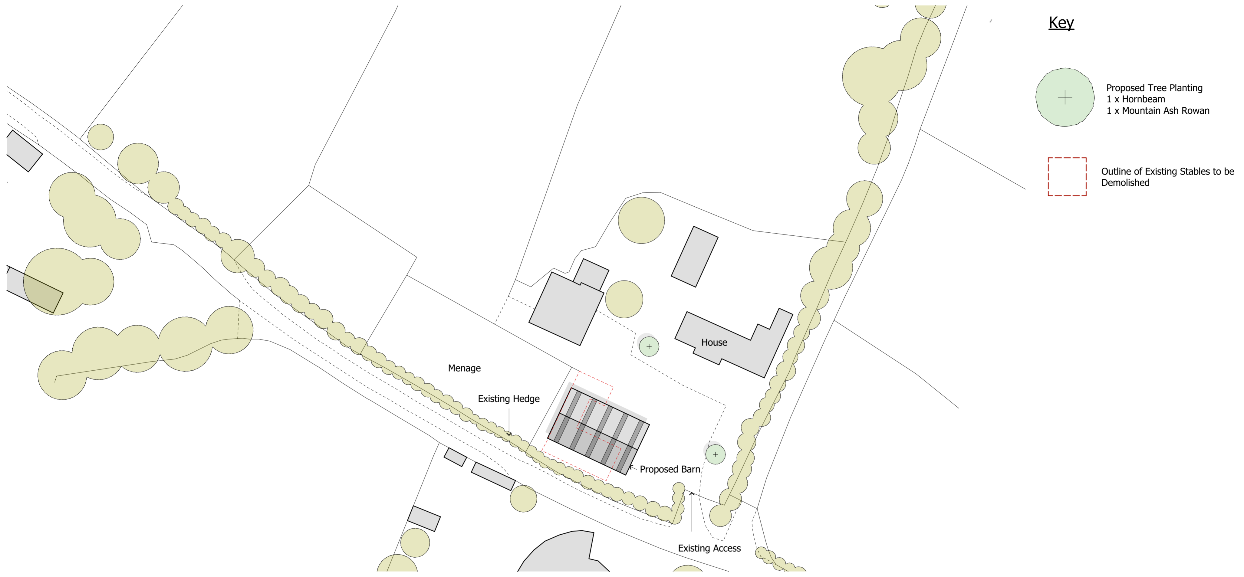
Proposed Site Layout 1:500