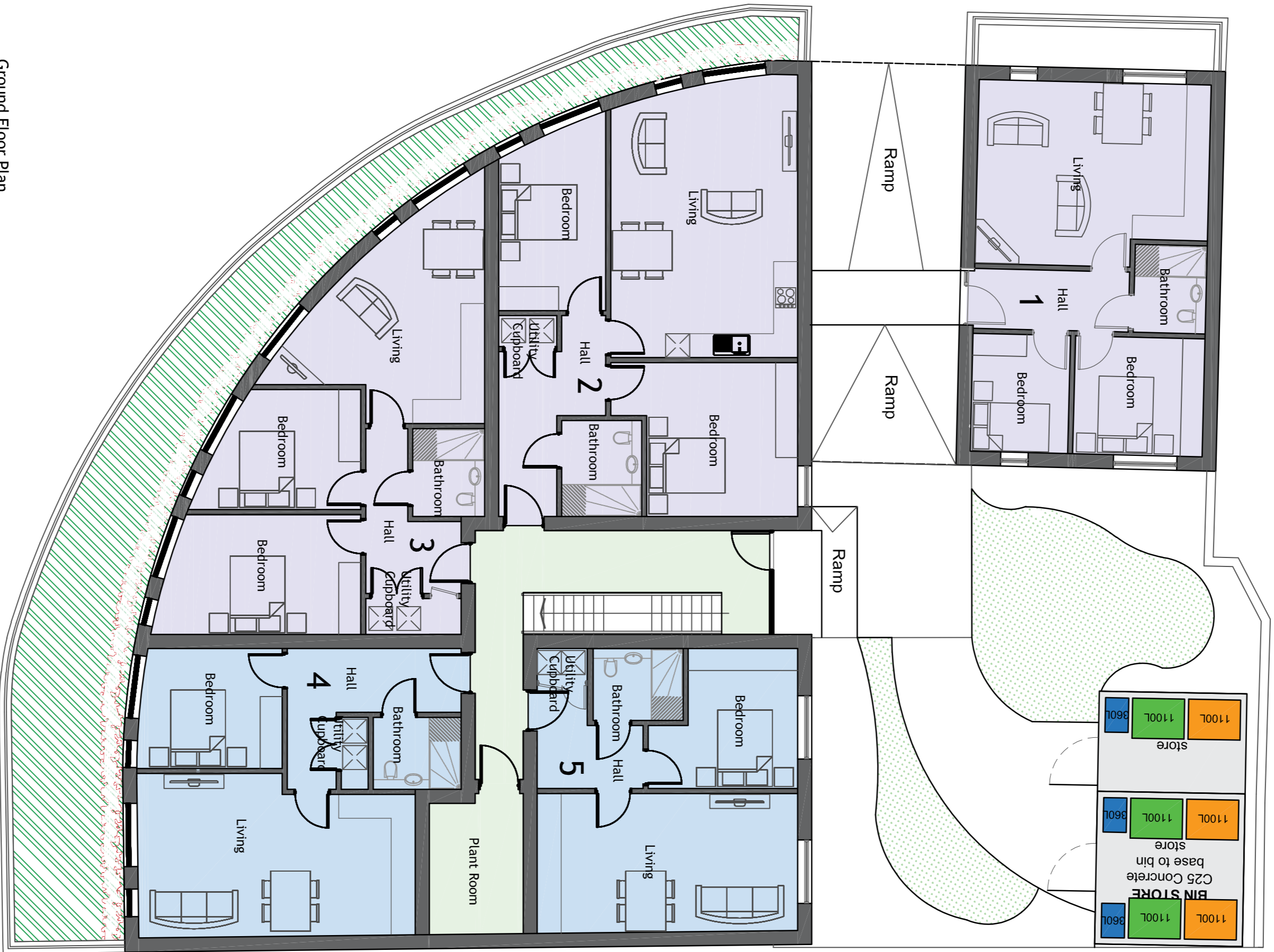
Ground Floor Plan Scale = 1:100