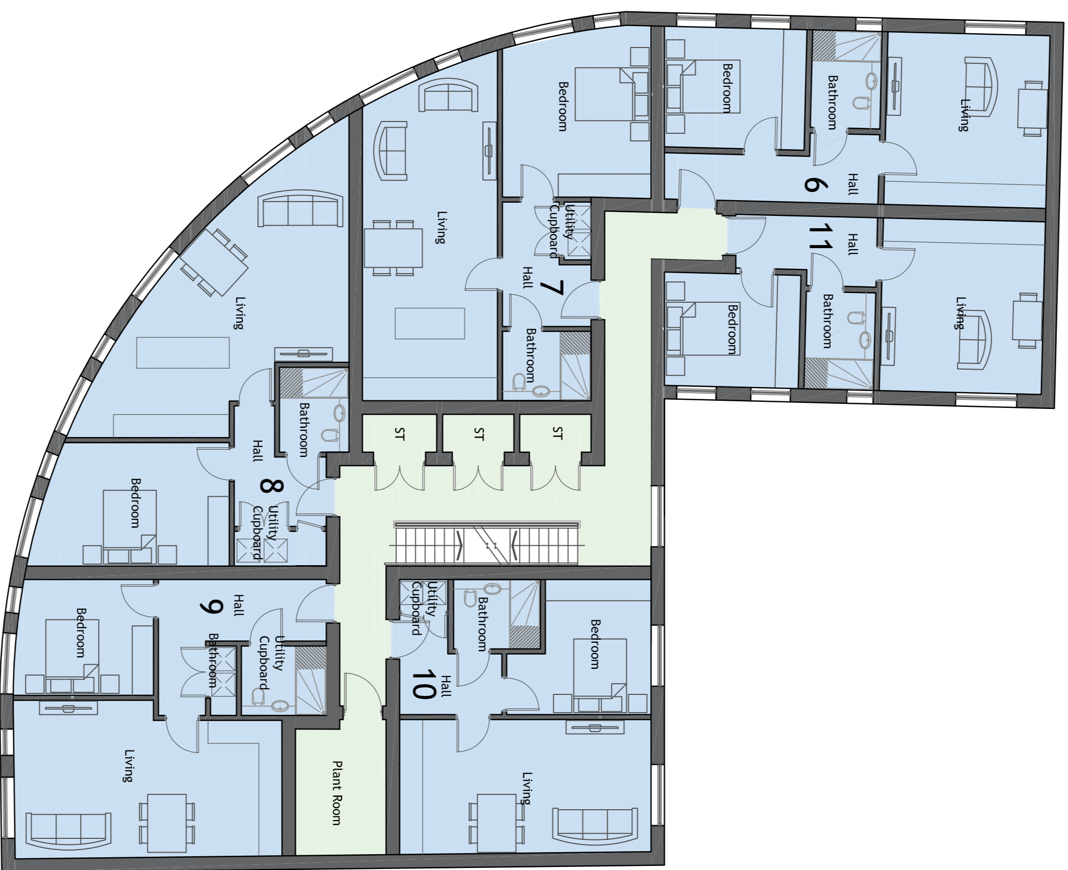
First Floor Plan Scale = 1:100

Rev: A Rev Date: 09/02/2024 Drawn By: JLC Rev Details: Window removed from living areas in Apartment 8 to match elevations Rev: - Rev Date: 14/12/2023 Drawn By: RM Rev Details: Initial Issue