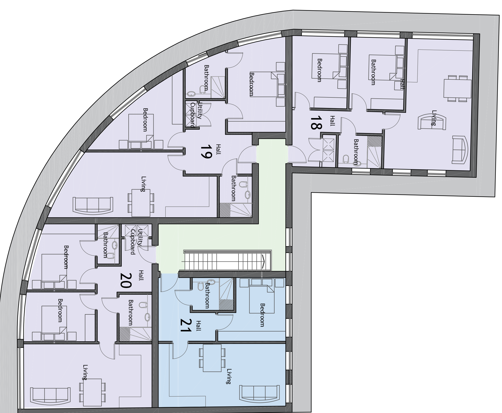
Top Floor Plan Scale - 1:100

Rev: - Rev Details: Initial Issue Rev Date: 04/12/2023 Drawn By: RM