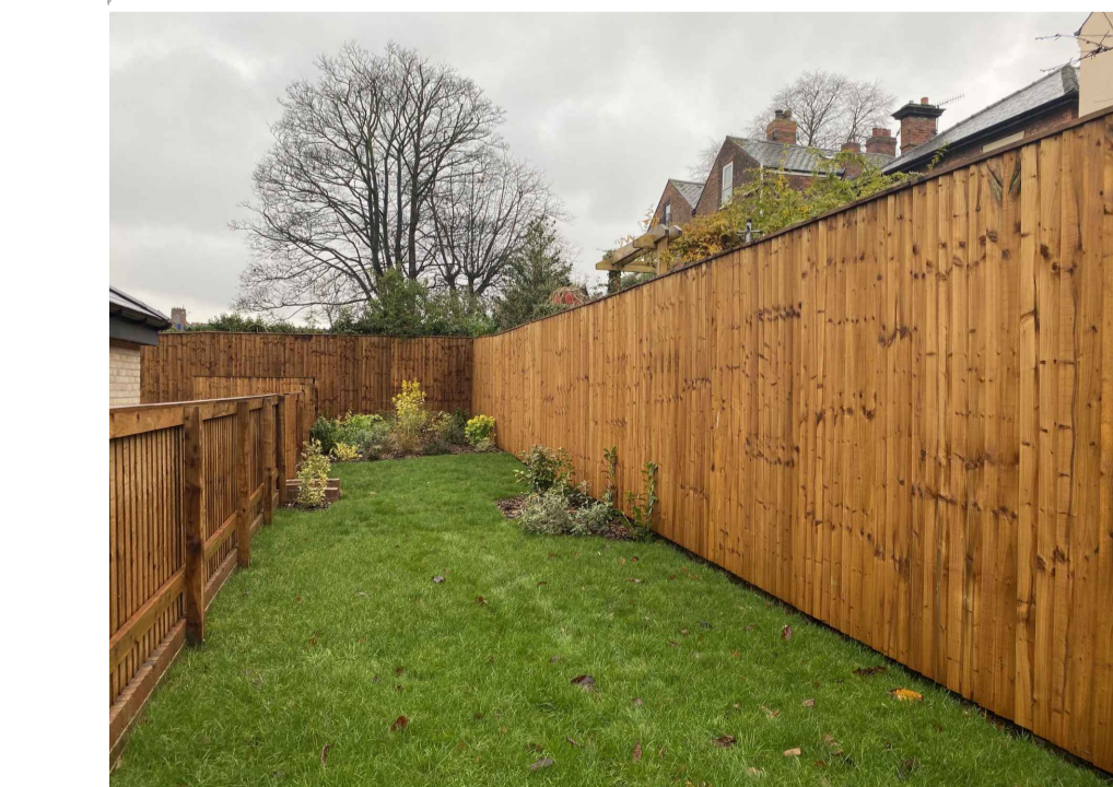
2400mm Close Boarded timber fence to rear and side site boundary