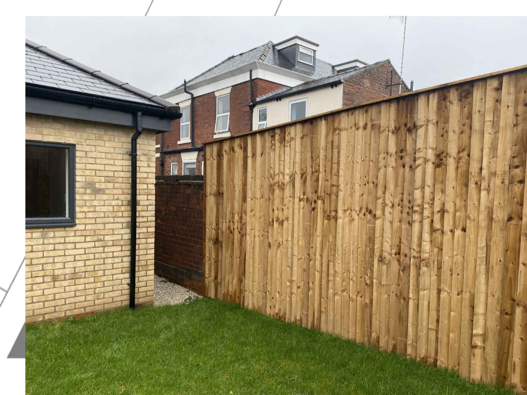
2400mm Close Boarded timber fence to rear and side site boundary