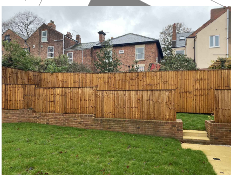
Close Boarded timber fence to rear and side site boundary Height 2400mm to match existing brick wall