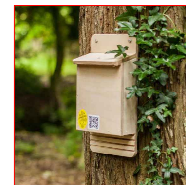
PROPOSED BAT BOX