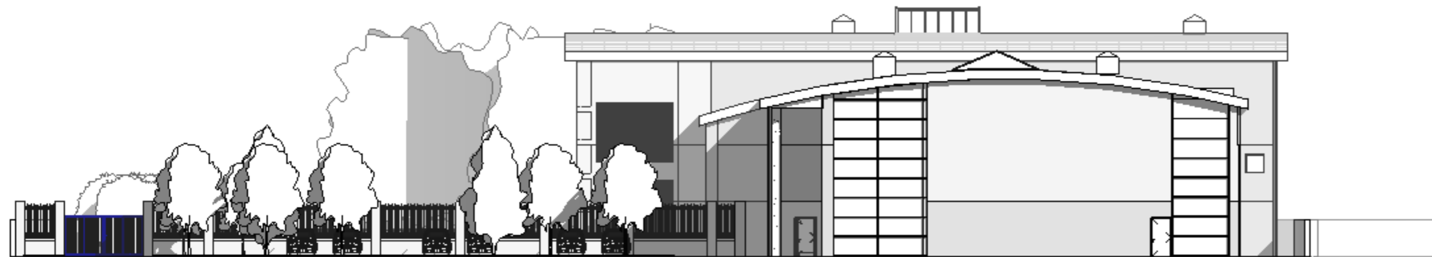
2 EXISTING NORTH WEST ELEVATION 1 : 200