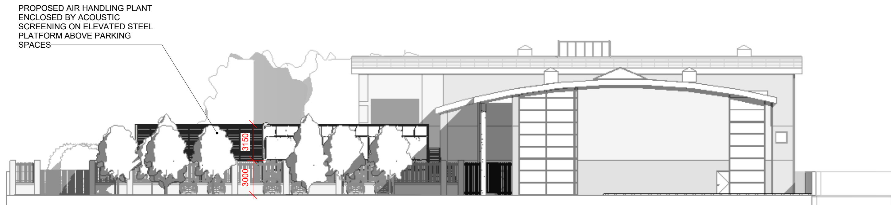
2 PROPOSED NORTH WEST ELEVATION 1 : 200