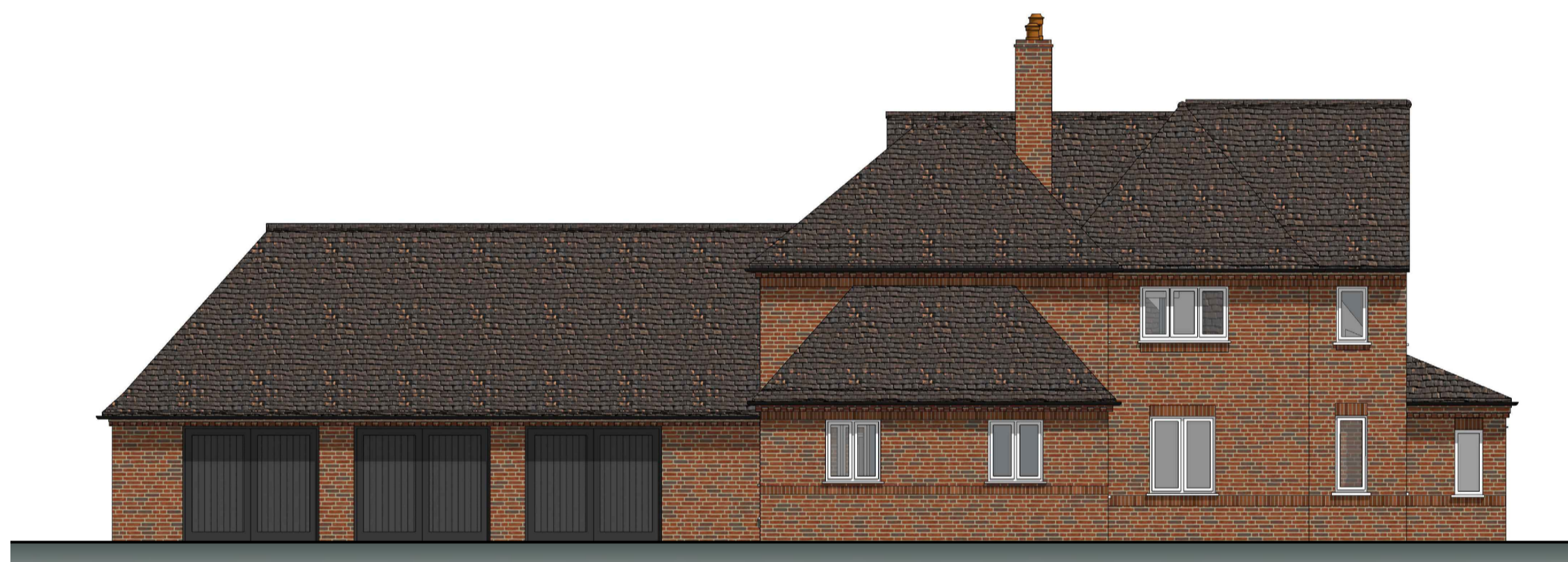
WEST ELEVATION 1