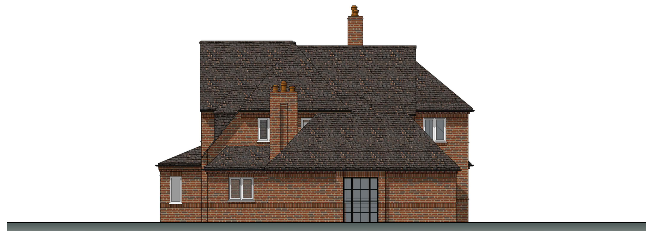
EAST ELEVATION 2