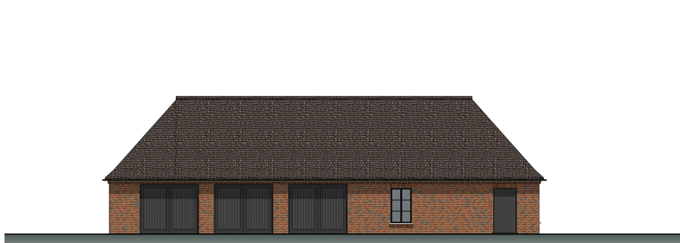
WEST ELEVATION 2