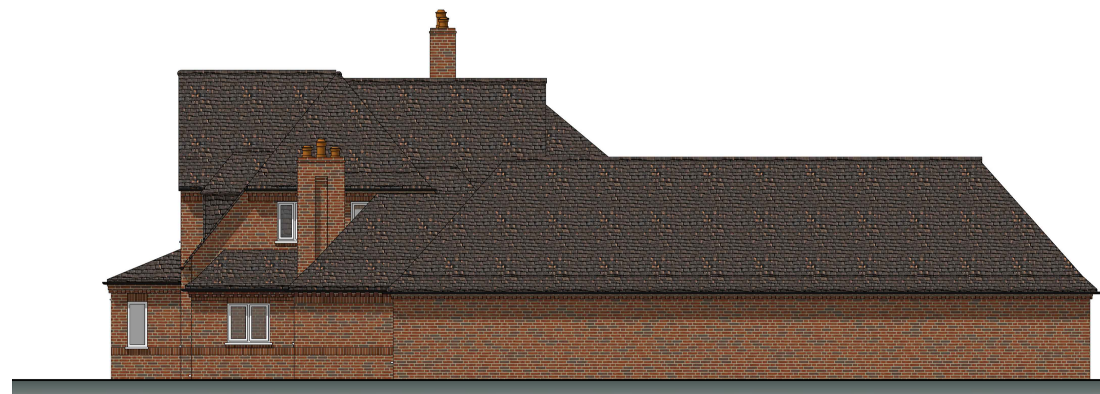
EAST ELEVATION 1