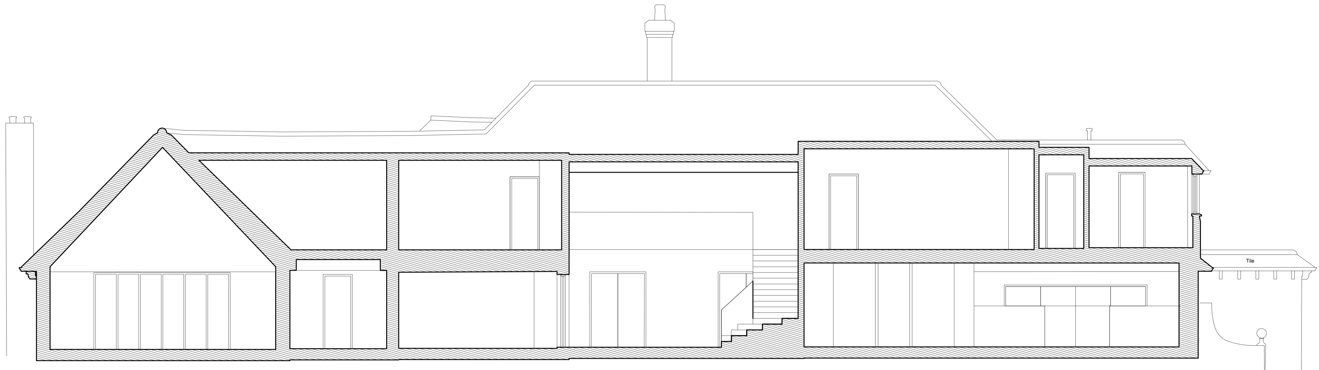
01 Existing Section AA Scale 1:50@A1; 1:100@A3