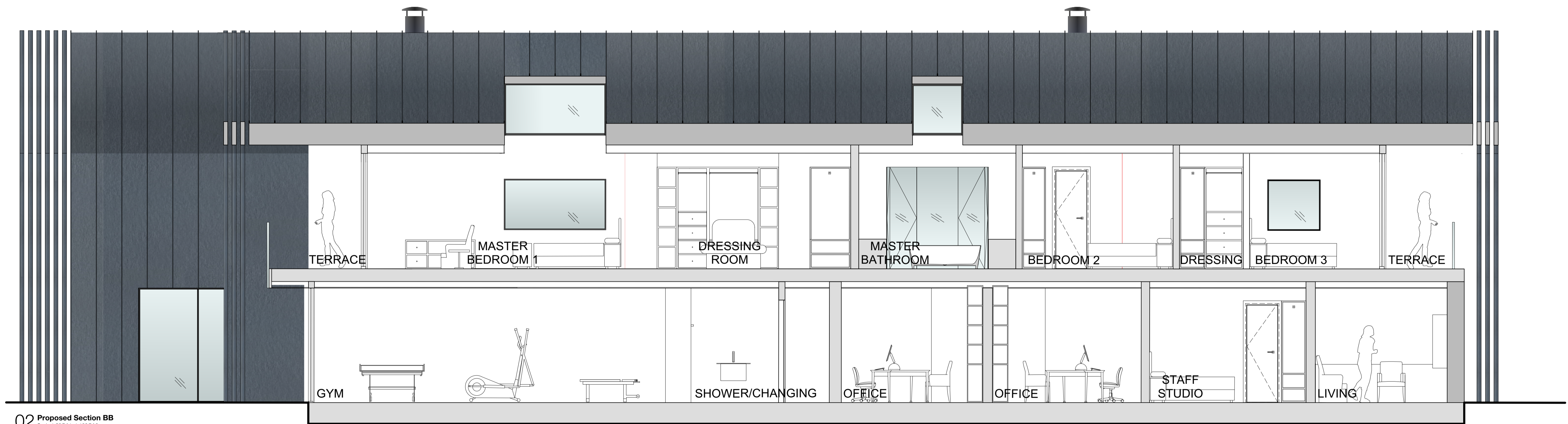
02 Proposed Section BB Scale 1:50@A1, 1:100@A3