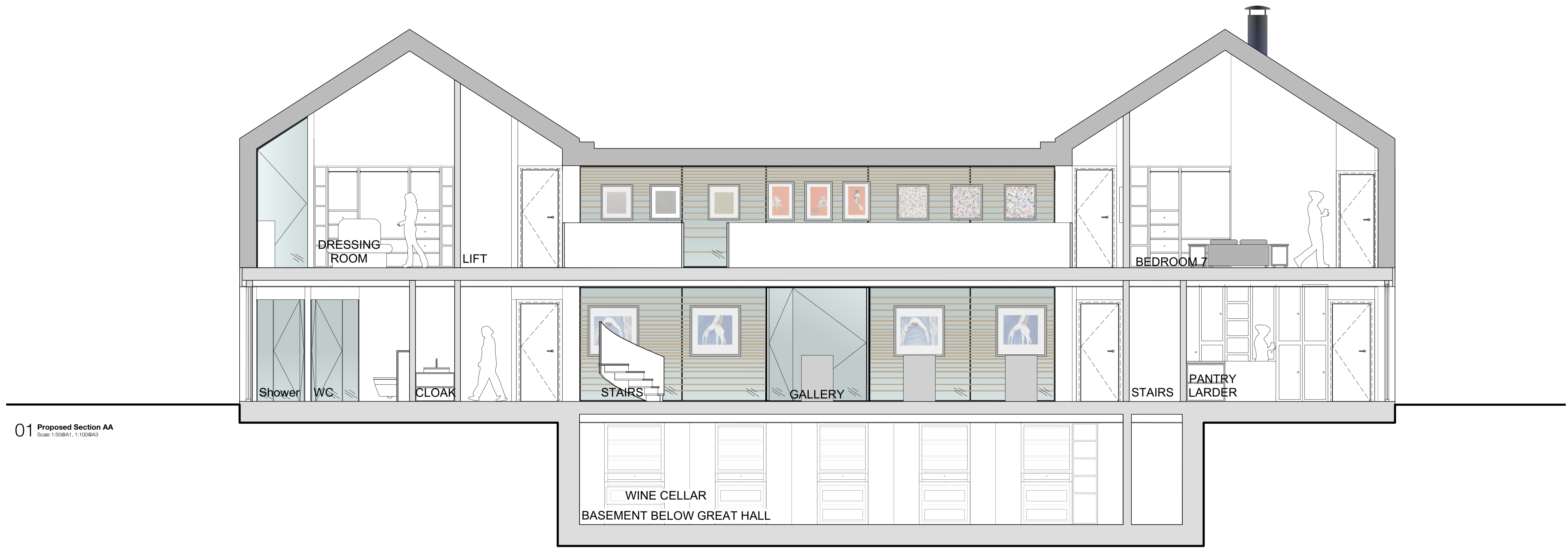
01 Proposed Section AA Scale 1:50@A1, 1:100@A3