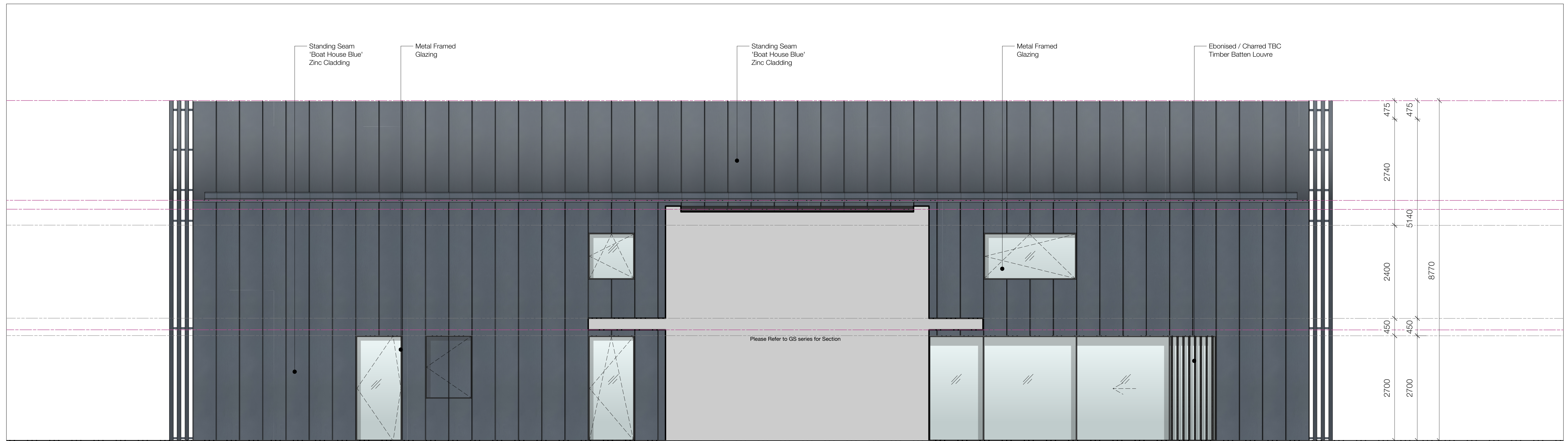
05 Proposed Side Elevation Scale 1:50@A1, 1:100@A3