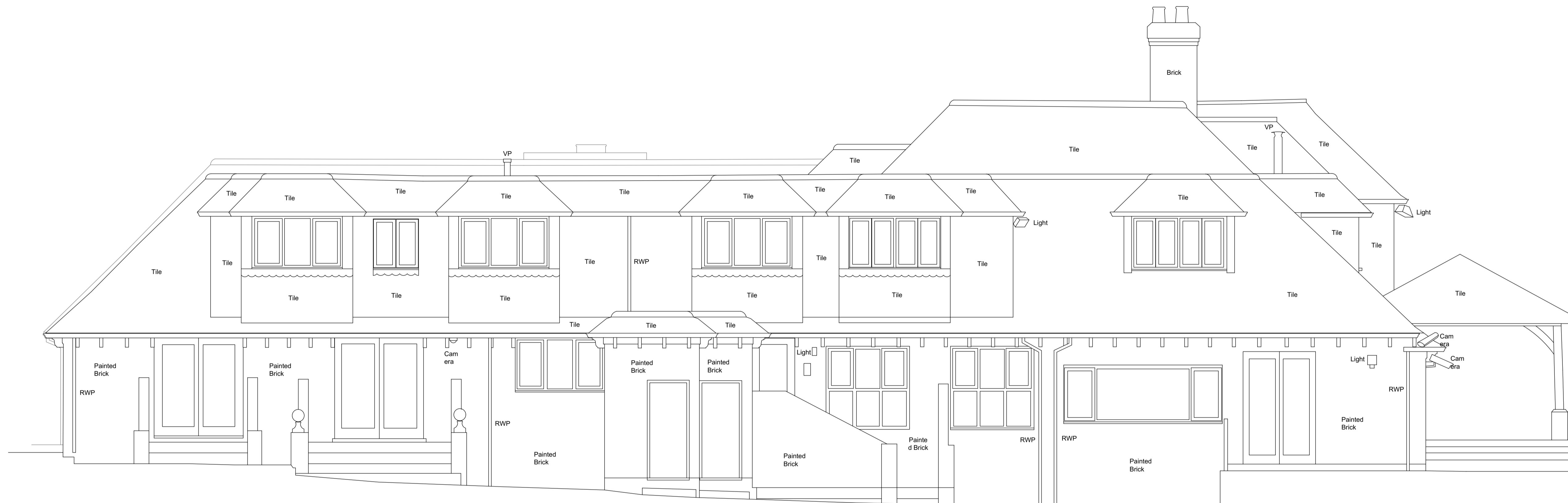
04 Existing North West Elevation Scale 1:50@A1, 1:100@A3