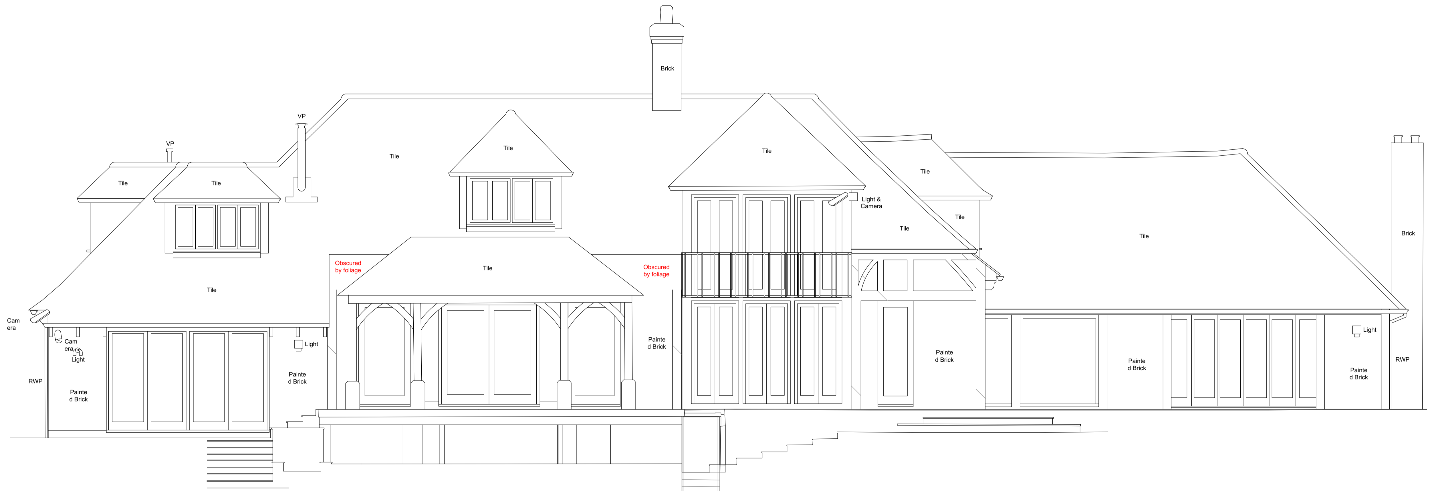
01 Existing South West Elevation Scale 1:50@A1; 1:100@A3