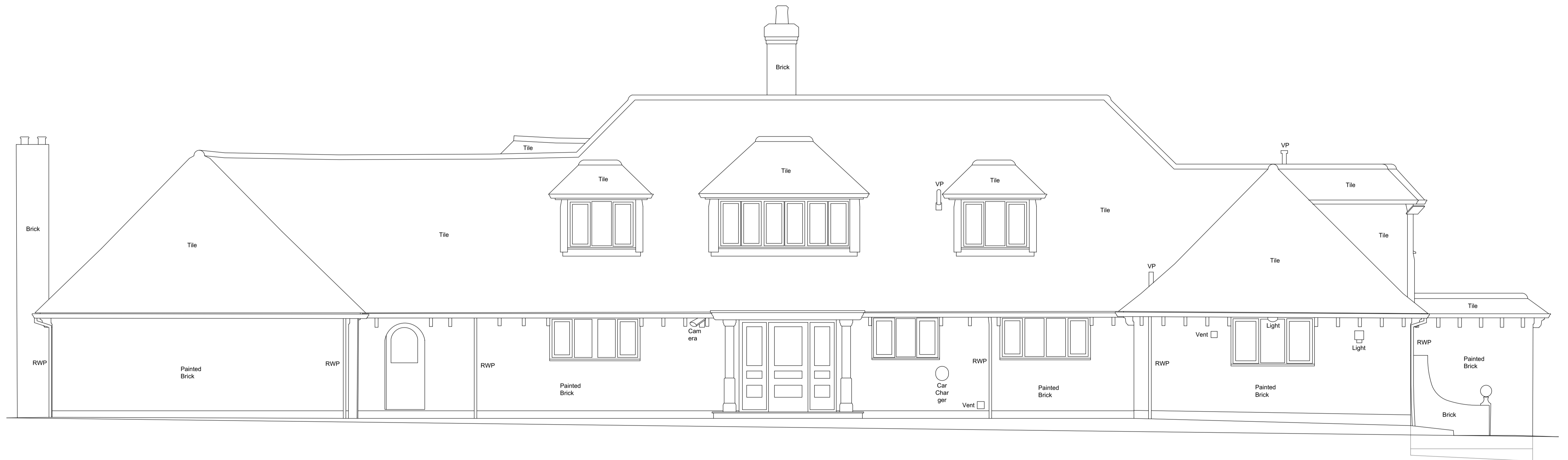
03 Existing North East Elevation Scale 1:50@A1, 1:100@A3