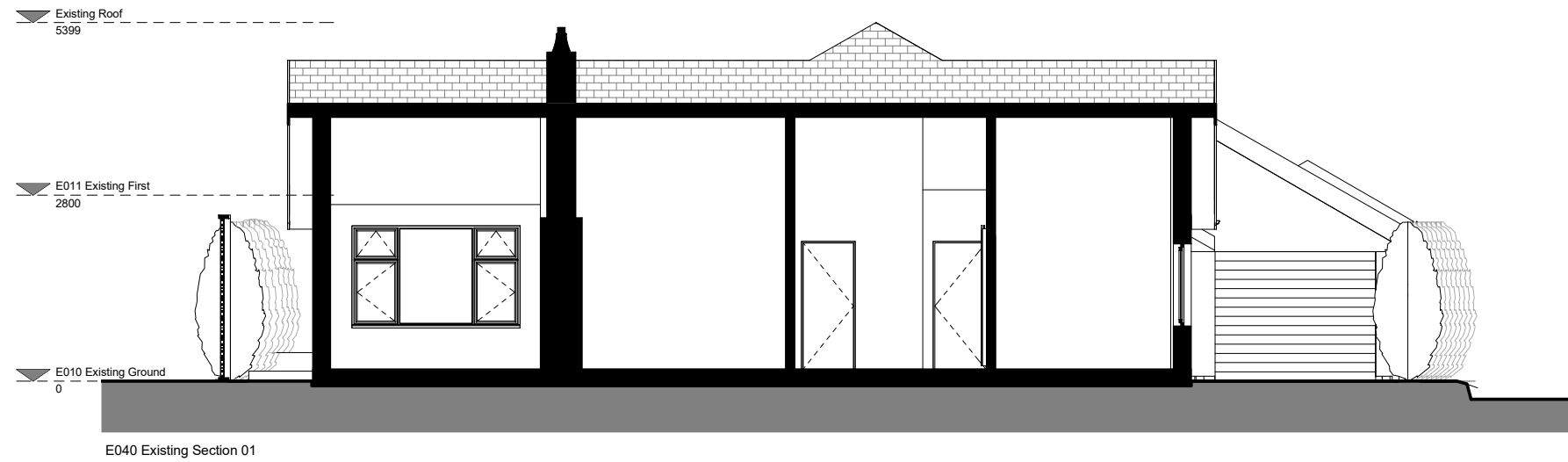
E040 Existing Section 01