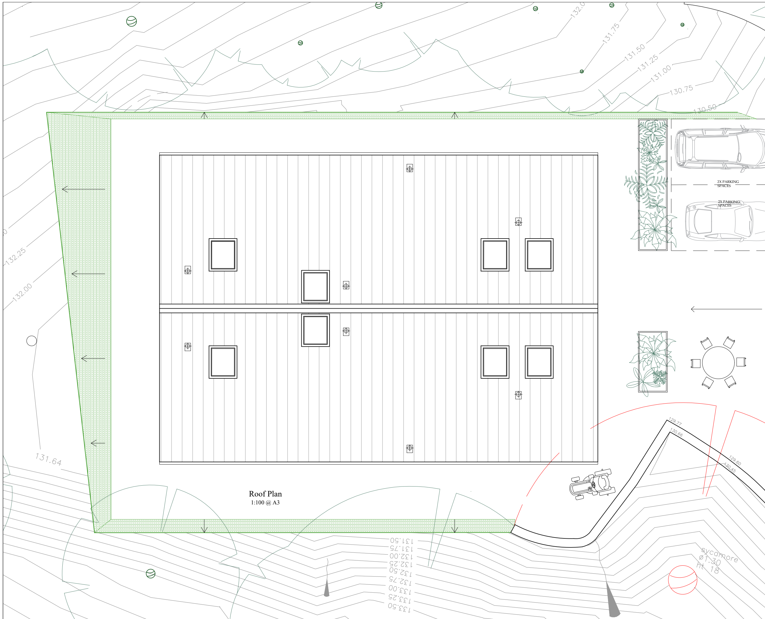
Roof Plan 1:100 @ A3

Notes This drawing is the copyright of Giles Quarme Architects and cannot be printed or reproduced without prior permission. This drawing has been based on survey information provided by others. All dimensions and setting out must be verified on site before commencement of the work, and any discrepancies notified to the architect. All windows and doors are to fit into existing openings unless stated otherwise. All dimensions are in millimetres unless stated otherwise.