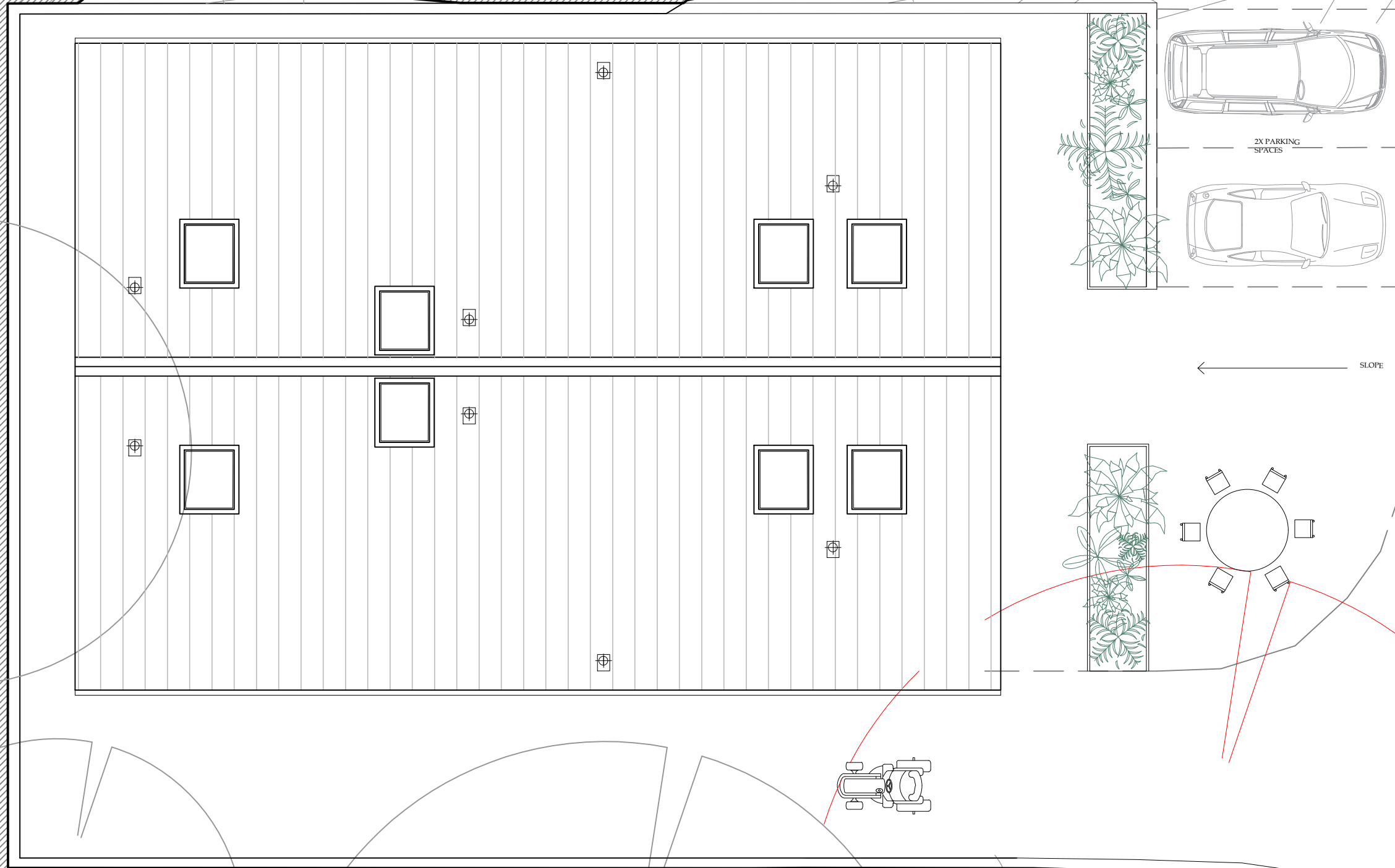
Roof Plan 1:100 @ A3

Notes This drawing is the copyright of Giles Quarme Architects and cannot be printed or reproduced without prior permission. This drawing has been based on survey information provided by others. All dimensions and setting out must be verified on site before commencement of the work, and any discrepancies notified to the architect. All windows and doors are to fit into existing openings unless stated otherwise. All dimensions are in millimetres unless stated otherwise.