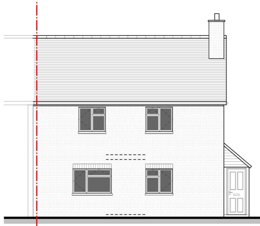
1 PROPOSED FRONT ELEVATION 04 SCALE 1:100 @A3