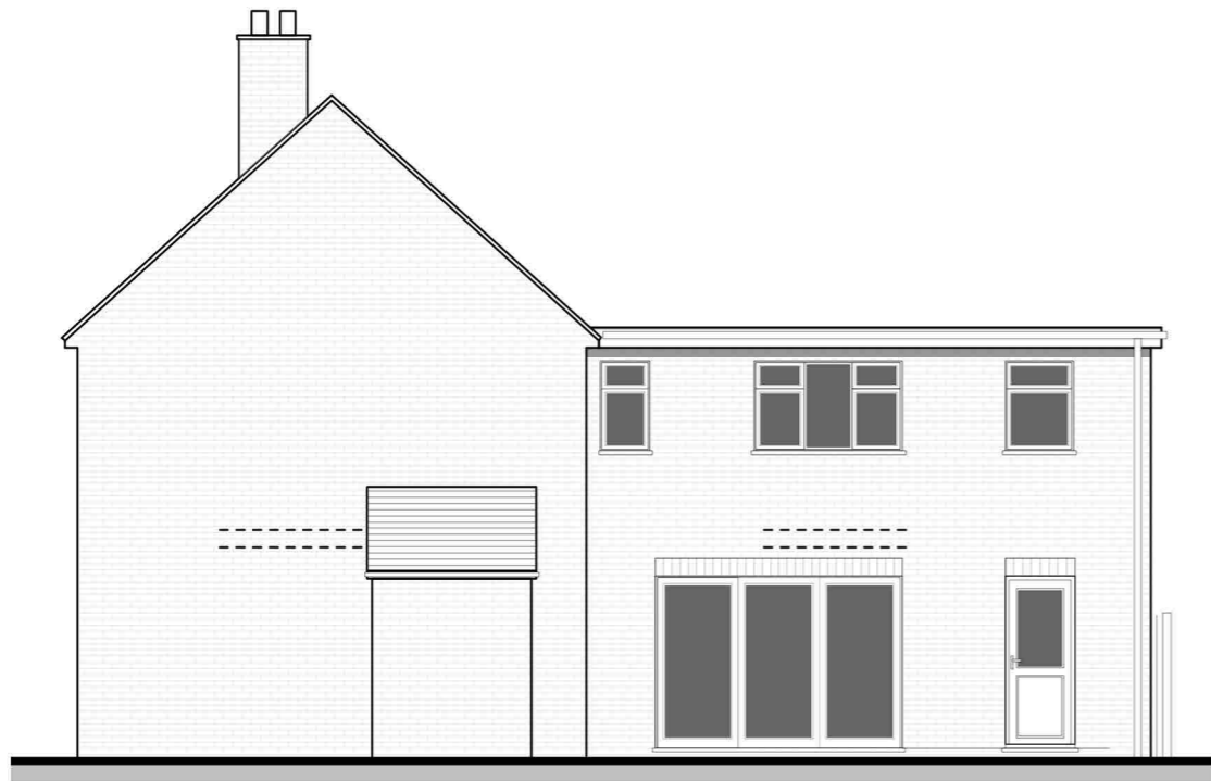
3 PROPOSED SIDE ELEVATION 04 SCALE 1:100 @A3