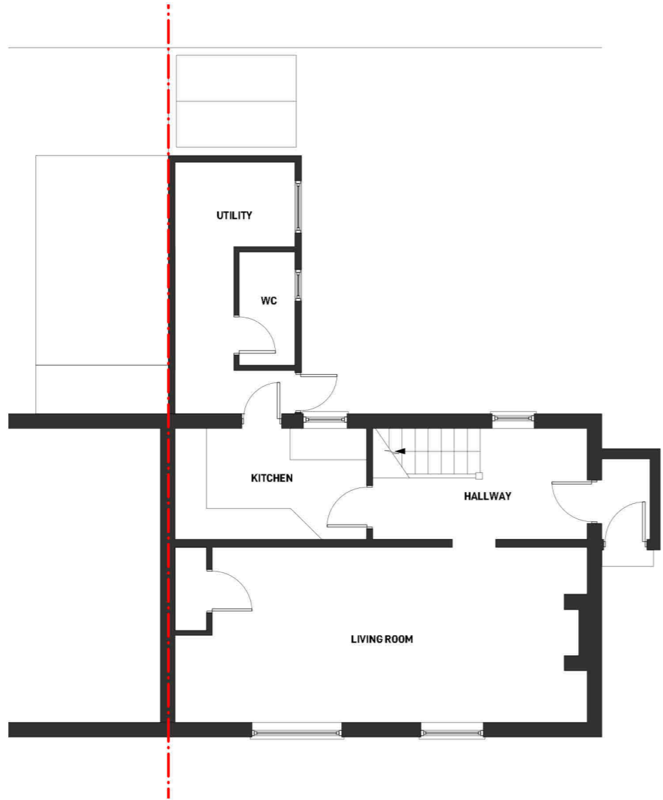
1 01 EXISTING GROUND FLOOR SCALE 1:100 @A3